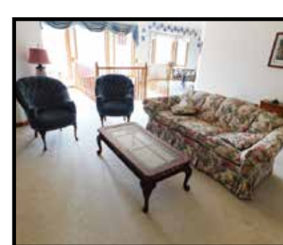
American Home, 3 cushion sofa, floral