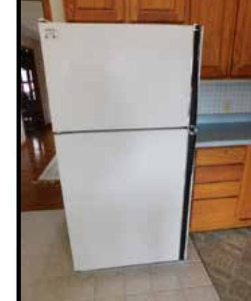
Refrigerator, nice, newer model