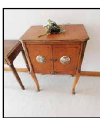
2 French type, inlay, 2 door cabinets