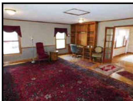
Kashan (Central Iran) 12'3"x19'3", approx. 100 yr. old rug, red background, dark blue border, floral overall design, 325 knots per square inch, appraised in 1982 for $11,500