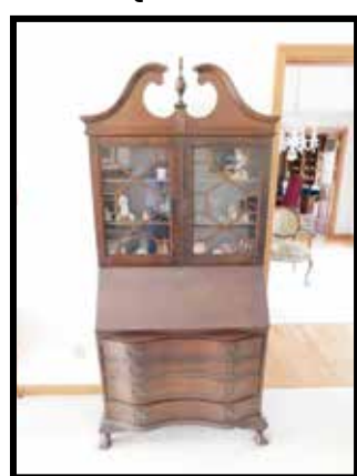
Bow front secretary w/drop front