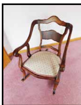
Bentwood rocker w/upholstered seat