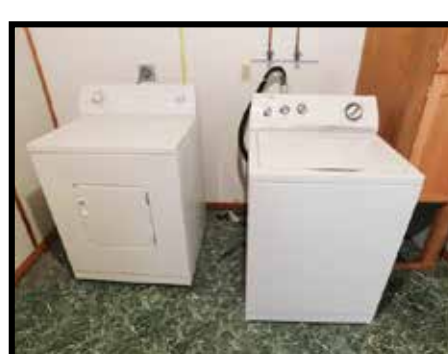
Whirlpool Special Edition, 3 cycle automatic washer & electric dryer, white nice set