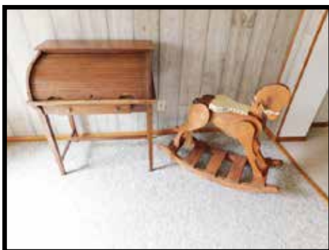
Youth size, roll top desk