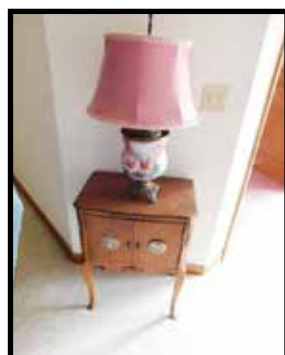
China & wrought iron base parlor lamp