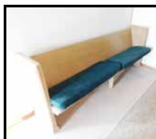
7' wooden church pew