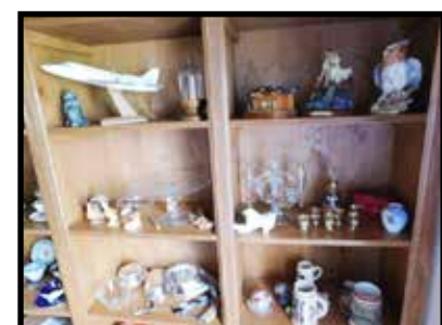
Candlewick cake plate on pedestal