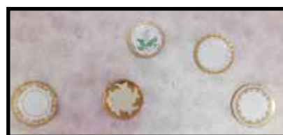
Limoges w/gold overlay, plates