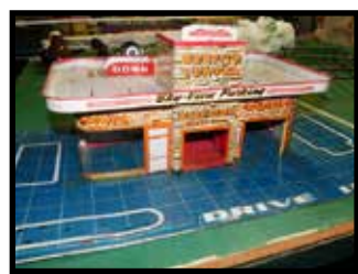
Tin Toy Service Center