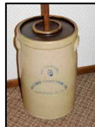
Macomb stoneware, 5 gal. Flow Blue stencil, butter churn