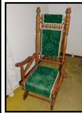
Primitive oak platform rocker w/upholstered seat & back, family pc.