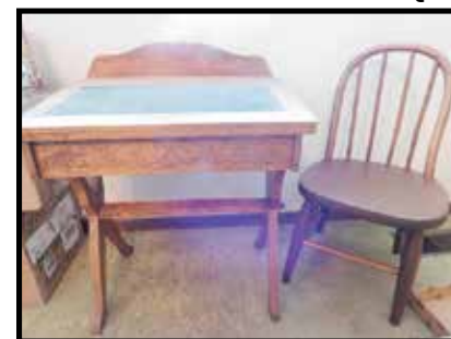
Early 1900s child's slate top, split top, school desk, neat pc.