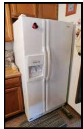
Whirlpool, 2 door, side by side refrigerator; white w/ water & ice dispenser, nice