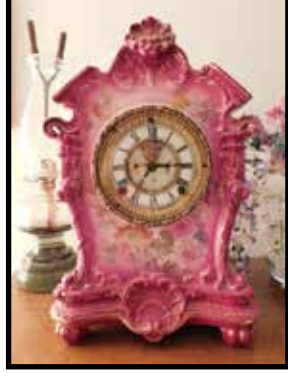
Ansonia, china shelf clock, great colors