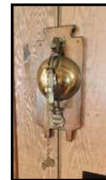
S.F. & Co. brass bell