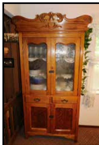
2 pc, oak kitchen cabinet w/ original frosted glass doors & crown, from Fred & Clara Seifert family