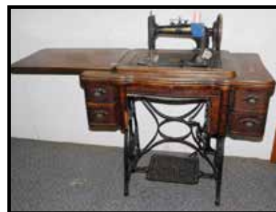
New Home treadle sewing machine