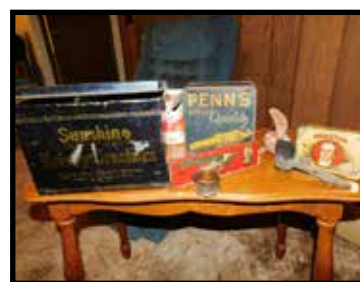
Sunshine Krispy Crackers tin