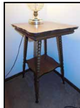
Oak, turned leg lamp table