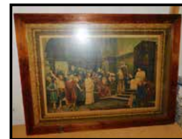
Religious print in frame