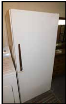
Kenmore, 15.1 cu. ft. upright deep freeze, white, nice