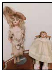
German Florodora AIM, bisque doll, given as a gift in 1904