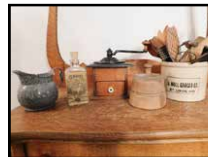
A. Moll Grocer Co.; St. Louis crock