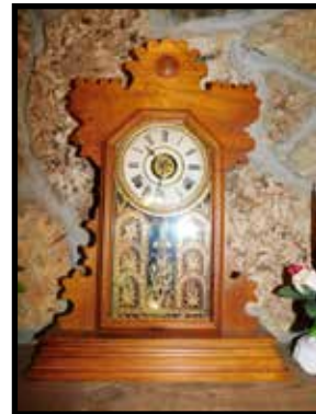
Ingram, walnut case, shelf clock w/glass front, nice