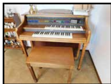
Lowery organ w/bench, very nice pc.