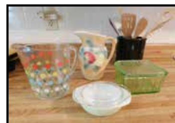
Royal Copley, fruit pattern pitcher