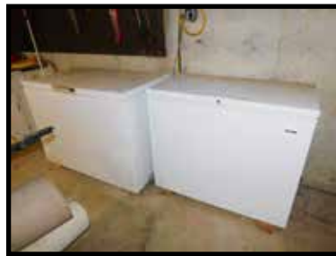
Kenmore chest type, deep freeze, approx. 15 cu. ft.