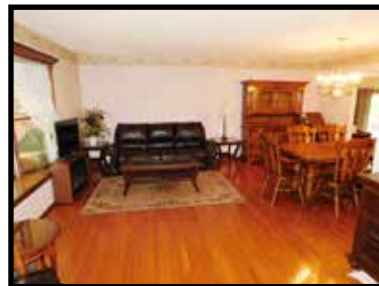
Oak, dining room table w/6 chairs & matching hutch, very nice set