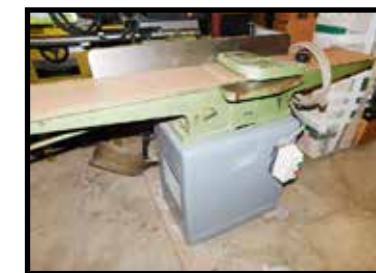
8" floor model, Grizzly jointer/planer