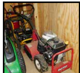
Snapper 8 ¼ hp rear tine garden tiller