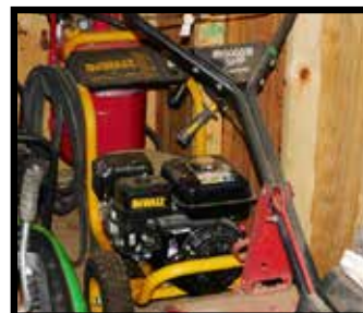
DeWalt, 3100 PSI power washer