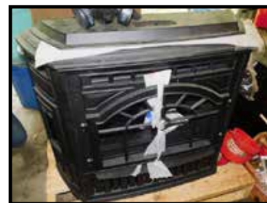
New pellet wood insert