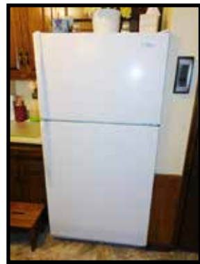
Whirlpool refrigerator, white