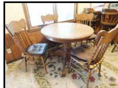
Round oak table, pedestal type w/claw feet, repo