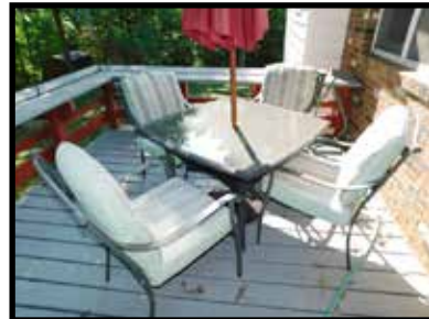
Glass top, patio table, 4 chairs & umbrella, nice set