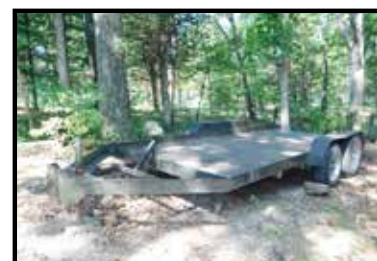
1980, 16' tandem axle trailer w/ steel bed, ball hitch, ramps & removable sides