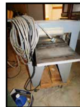
Woodmaster 12" planer, floor model