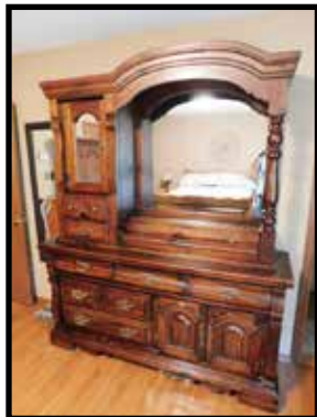
Massive, 2 door chest w/matching oversize dresser w/mirrored & storage top, nice pc.