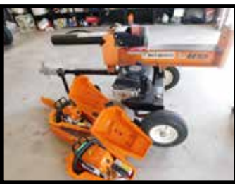
Buchheit 22 ton log splitter, vertical/horizontal, excellent