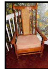
Assorted antique chairs