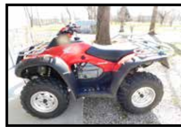
2005 Honda TRX650 4 wheeler, 4x4 electric or automatic shift, GPS system, dealer installed Warn Winch, 231.7 hrs, excellent condition, red