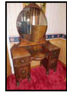
1940's art deco vanity w/mirror