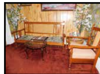
3 piece oak parlor set, cane back, love seat & 2 chairs(1 high back)