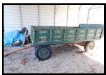
12'x6 1/2' farm wagon, pin hitch, lights wired for road use(hayride wagon), 4 prong