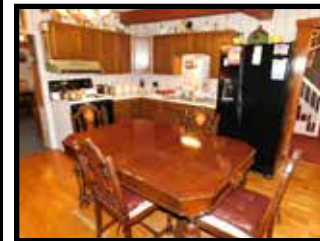
1940's art deco 62"x42" dining room table(w/inlaid wood motif in table & 4 chairs) w/matching china cabinet & buffet