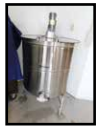
Dadant 20 frame radial, like new 8 years old