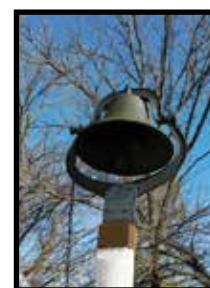
Dinner bell, 18" w/#3 yoke dated 1886