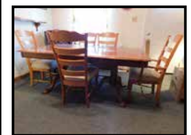
Rectangle oak table, 72"x42" w/5 chairs(1 armed)