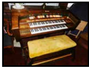
Gulbransen series 600 w/magic touch, w/ bench seat, organ dimensions 55"X44"X30"