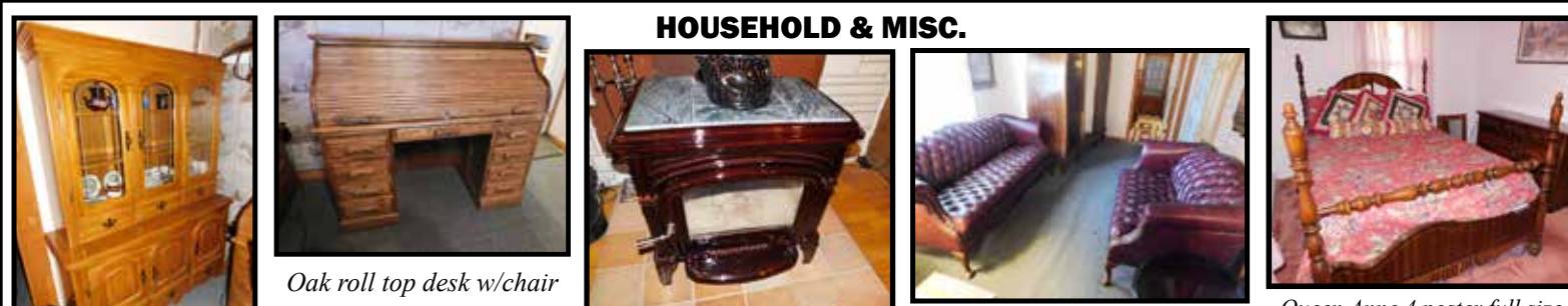
Oak roll top desk w/chair