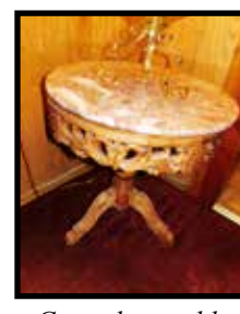
Carved tea table w/marble top