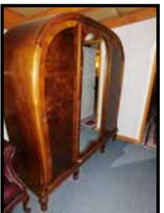
BS Aires chiffonier mirrored 3 door wardrobe, super piece - Corner table - Milk cans - Partial list