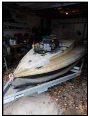
Hovercraft Build Job w/Kohler Pro 23 engine, fiberglass body w/trailer