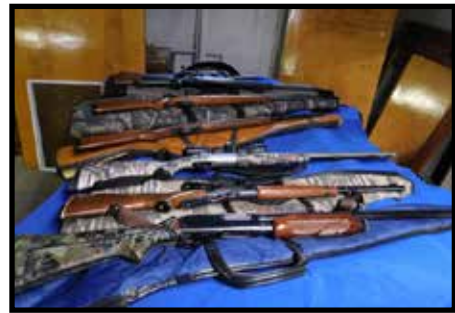
Remington Model 870 Magnum, 12 ga. pump