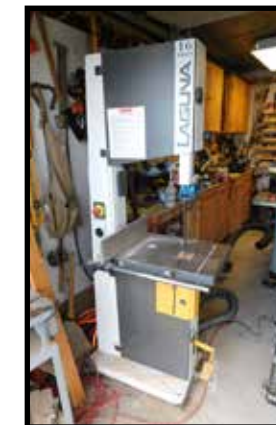
Laguna LT 16 HD 16" floor model band saw by Novellarai