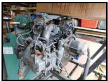
1 aluminum 16 valve Japan engine