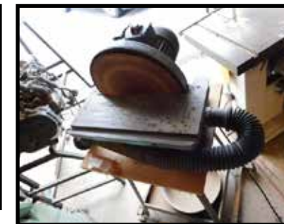
Delta 12" disk sander