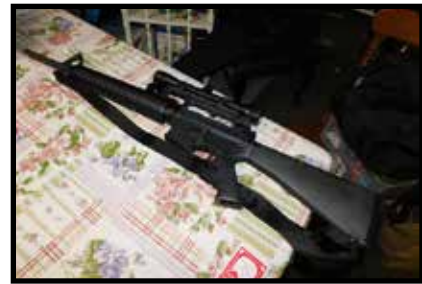
Browning A-Bolt, cal. 270 WSM w/Monarch scope & sling