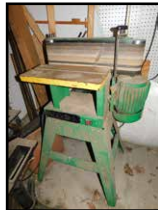
1"x30" belt & disk sander