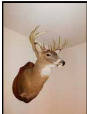
2, 8 pt