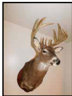
1, 14 pt massive