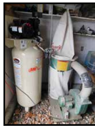
Ingersoll Rand upright air compressor, like new