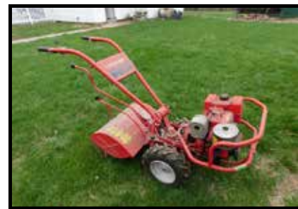
Troy Bilt, 7 hp rear tine tiller