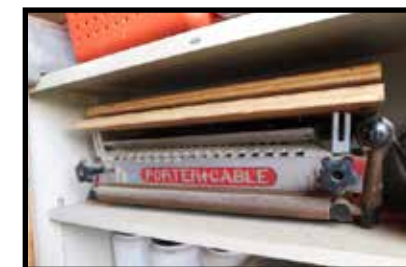
Porter Cable dove tail jig