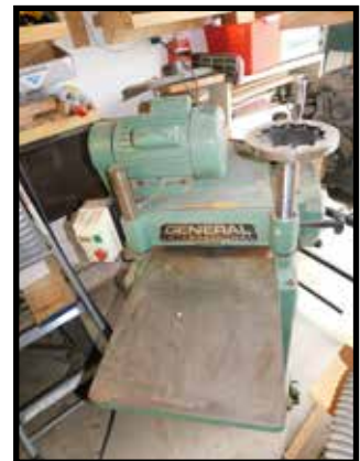
General International 15" floor model, 1 hp planer