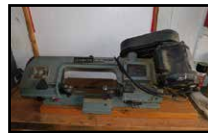
Delta 4"x6" horizontal 1/3 hp band saw