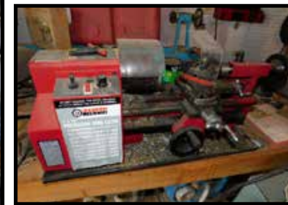
Central Machinery 7"x10" Precision mini lathe