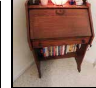
Oak, drop front desk