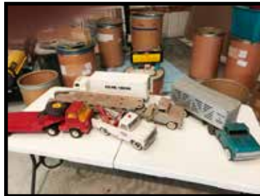
Structo Livestock Trucking, truck/trailer