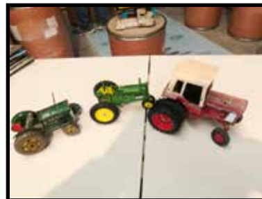
Tin wind-up toy tractor