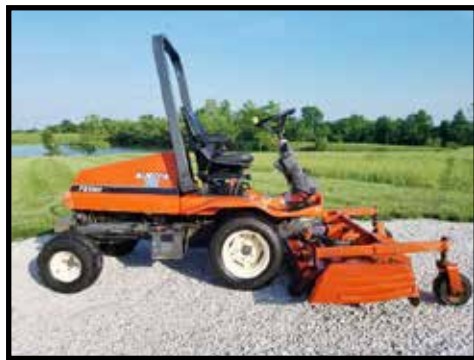
2001 Kubota F2560, diesel, 4 wheel drive, 72" front deck mower, bought new