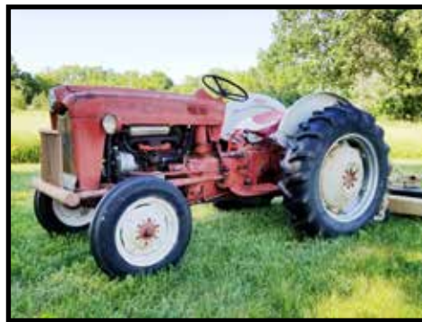
601 Ford Workmaster tractor, 3 pt, wide front end, sharp