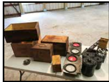
Lionel Corp coal elevator