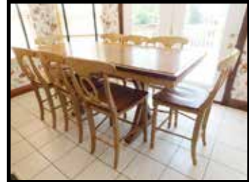
Tall bar height, dining room table & 8 chairs w/leaf