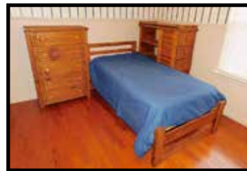
6pc, pine bedroom set; single bed complete, dresser, chest, desks & storage chest, nice set