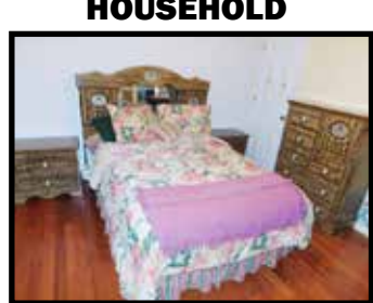
5pc. oak bedroom set; bed, dresser, chest & nightstands