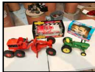
Ny-Lint toy road grader