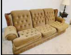
Sofa & chair, light brown w/oak trim