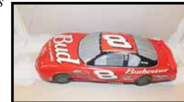
Bud #8 advertising display car