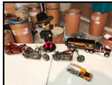
Harley oil truck