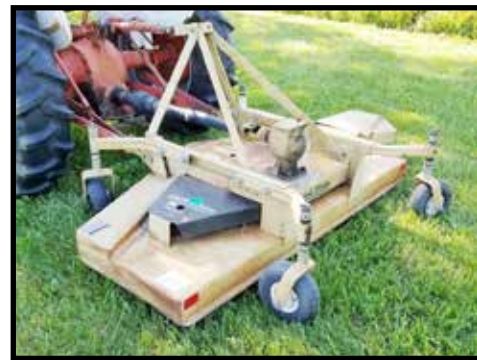
Landpride AT2572, 3 pt finish mower