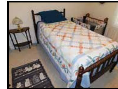
Single, spool bed, complete