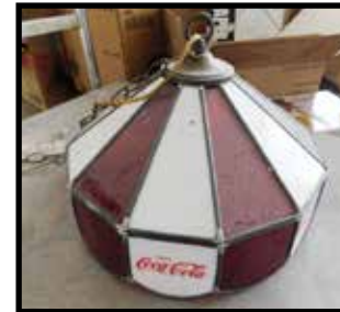
11 Classic Coca Cola, leaded glass light fixtures