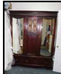
2 door, mirrored wardrobe w/drawers, nice pc