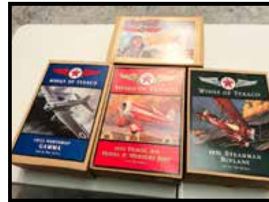
Texaco Wings of Texaco, NIB