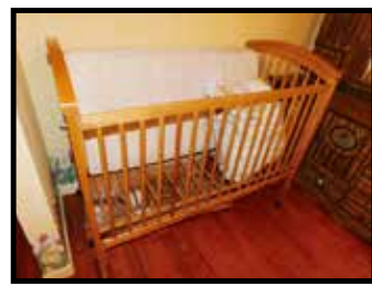
Baby crib, complete