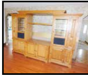
5 pc, oak entertainment center (Troy Furniture), beautiful set