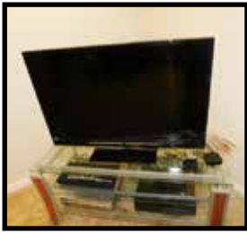
45" Sony flat screen TV w/stand