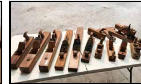
15 wooden block & cabinet planes