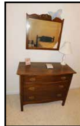
Oak, 3 drawer dresser