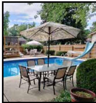
Glass-top patio table & 6 chairs