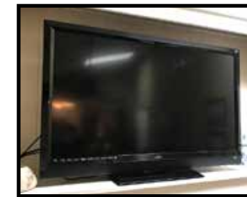
Vizio 48" flat screen TV