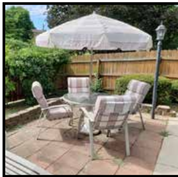
Patio table & 4 chairs