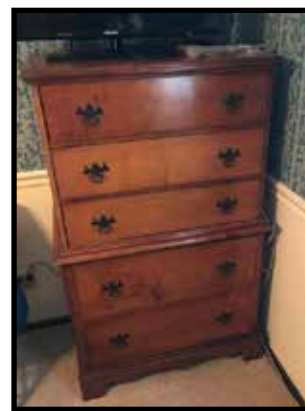
Early maple dresser w/matching highboy chest, vanity & stool