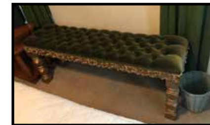
1960's Mid-Modern king size bed w/bedside bench