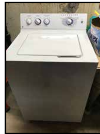
GE automatic washer, white, like new