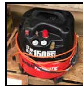
Central pneumatic 1.5hp, 8-gal, 150 PSI air compressor, like new