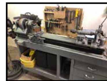
South Bend lathe w/24" bed, complete w/chucks, face plates, cutters, etc.