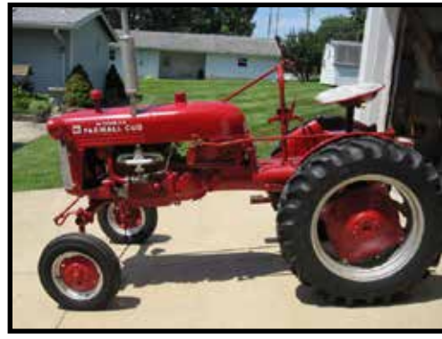
1948 IH Farmall Cub model F-CUB, Ser. 33528, wide-front, restored, parade ready