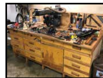
10" Craftsman radial arm saw & workstation