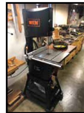
Wren 14" band saw w/stand, like new