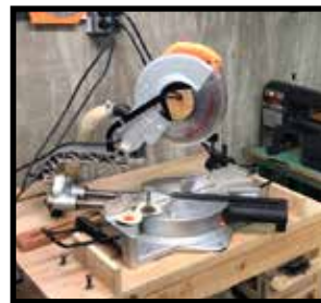
10" compound miter saw