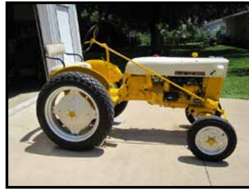
1968 International Cub Lo Boy, Ser. 22733 J, wide-front, sharp