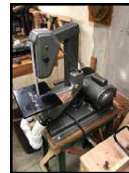
Foley belt & disk sander