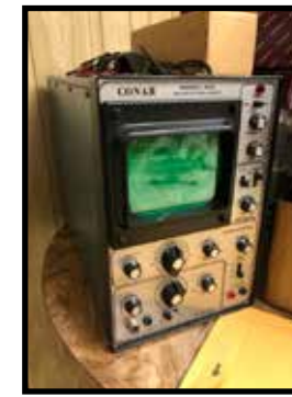
Conar Model 255 Solid State oscilloscope