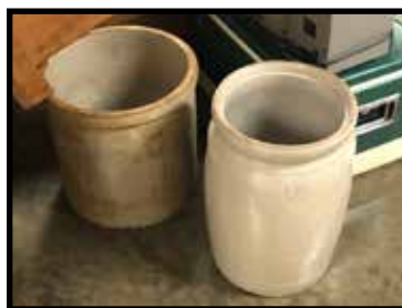
5gal crock churn