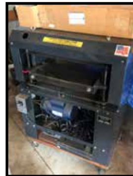
Woods Master Model 718, 18" planer w/accessories, nice unit