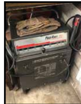
Wards Power-Kraft 230 welder, continuous amp control