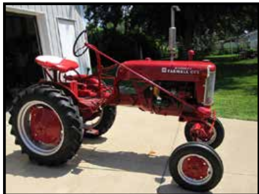
1948 IH Farmall Cub model F-CUB, Ser. 31485, wide-front, restored, parade ready

Note: Charlie restored these 3 tractors. They're as nice as we've sold. Collector's - Take Note.