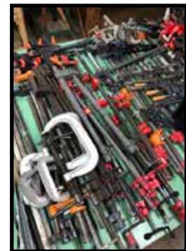
Lot pipe wood clamps