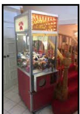
Bear claw arcade machine, floor-model, nice