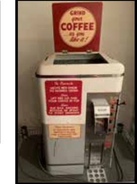
Vintage commercial coffee grinding machine