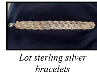
Lot sterling silver bracelets