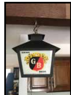
Griesedieck Bros. lighted bar sign