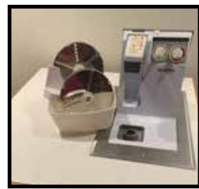
Ronson Food prep center in oak cabinet w/accessories