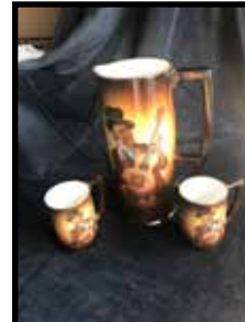
Toby beer pitcher & 6 mug set