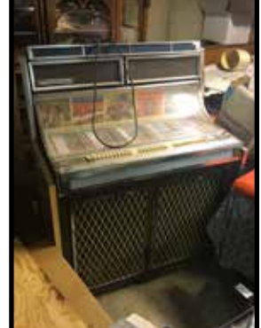
Seeburg stereo, 3-way audio jukebox