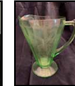
Lot green depression glass