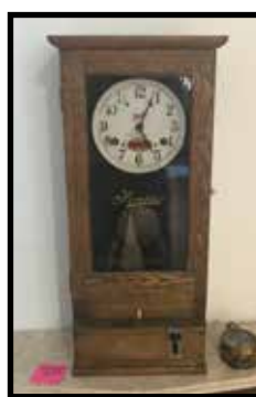
Simplex time clock, oak case, nice