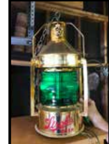
2, Strohs Beer hanging bar lights