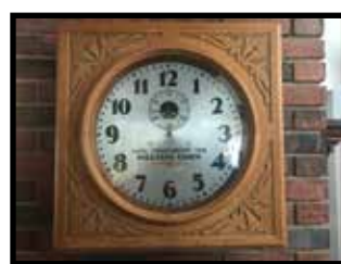
Naval observatory time, Western Union wall clock, self-winding, nice pc.