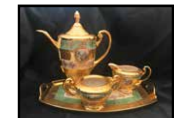
Le Mieux china, 24K gold, hand decorated coffee set