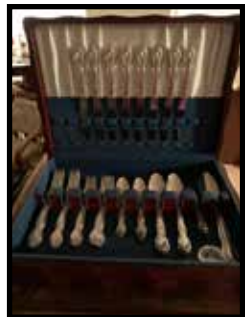
Flatware serving pc.