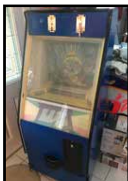
Silver Mine slide machine, floor-model