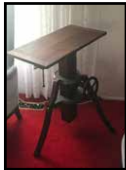
Industrial engineers drafting table, super pc.