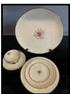
Set Flintridge, silver rim Rose china