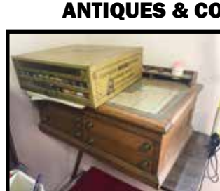
J&P Coats oak desk-type, 4-drawer spool cabinet