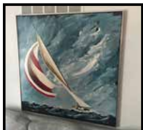
Nautical painting in frame by Conley