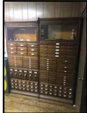
2, Law Barrister oak, 5-stack legal cabinets w/drawers & bins, Hancock Co. ILL & Courthouse Carthage ILL, super nice pc.