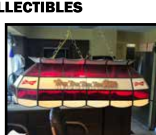
Budweiser pool table light