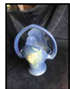
Roseville #392, 10" basket