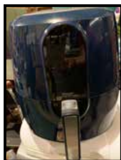
3 new air fryers