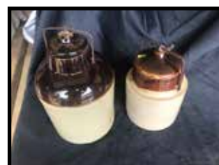
Weir crock jug w/lid