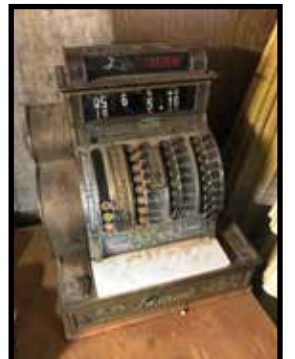
Antique brass cash register, #830190-421, nice