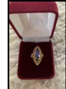
Amethyst ladies ring