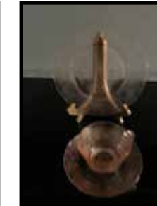
Lot pink depression, dogwood pattern