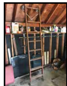
2 library ladders, 8' & 10'