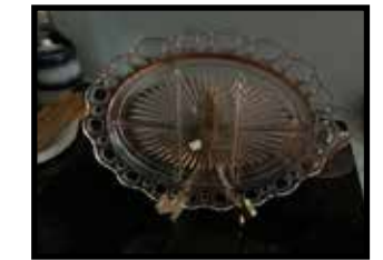
Open lace pink depression