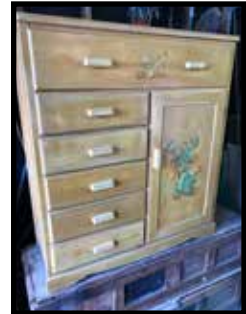
2, child's Storkline baby chest/dresser