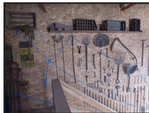
- Cast iron implement seat