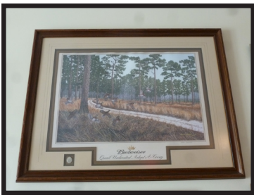
- 6. Budweiser 2005 Quails Unlimited Adopt-A-Covey by Allen Copeland print in frame