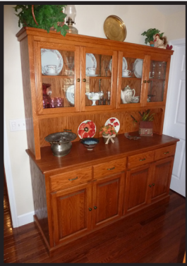
- Oak table, 9'x40" wide with 10 oak chairs and 2 piece oak hutch, massive set