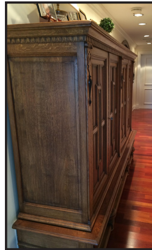
- 1930s oak breakfront armoire, 4 door, very ornate piece