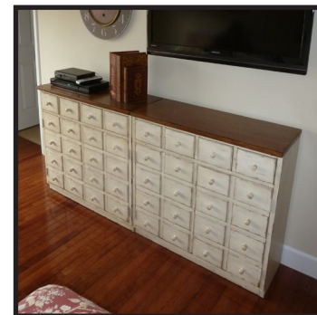
- 2 Pottery Barn, 20 bin storage cabinets