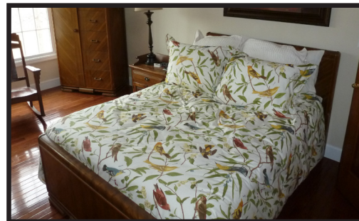
- Waterfall pattern Art Deco bedroom set; bed complete, dresser & wardrobe