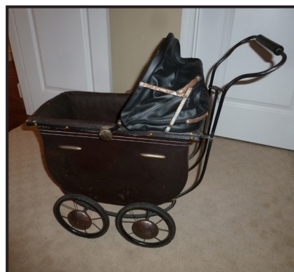
- Doll buggy