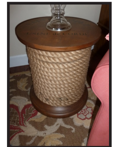
-Pottery Barn spool/rope lamp table