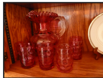
- Fenton cranberry color pitcher & tumbler set