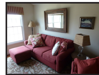
- Pottery Barn 3 cushion sofa & chair, brushed canvas, sierra color, nice set