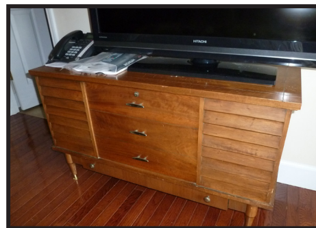
- Lane retro cedar chest