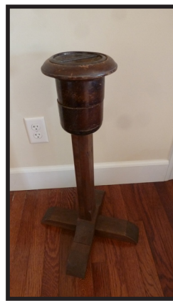
- Early cigar stand