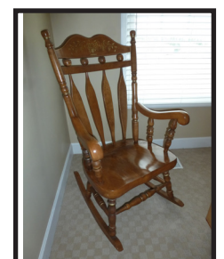
- 2 stenciled back rockers