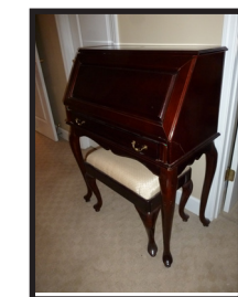
- Dark mahogany drop front secretary with bench