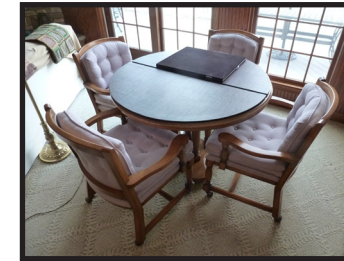
- Round oak table with leaf & 4 chairs