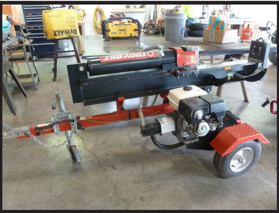
- Troy Bilt 8 hp LS338, 33 ton trailer type, vertical/horizontal log splitter