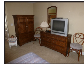
- Oak bedroom set by Chatham-Oaksby-Drexel; queen size bed complete, highboy dresser, wall mirror & nightstand