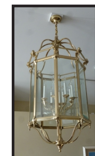
- Huge hurricane type chandelier