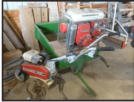
- Honda F-401 tricycle type garden tiller