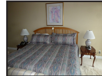
- King size bed complete with headboard