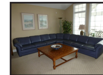
- 3 piece Flexsteel top grain leather sectional corner sofa, seats 8, periwinkle, nice