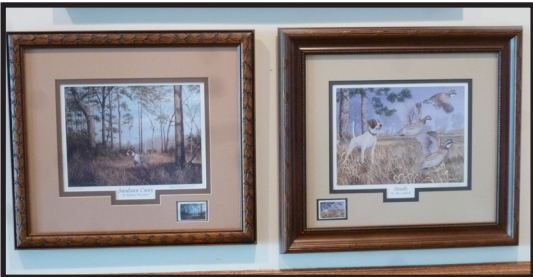
- 8. Sundown Covey by Richard Plasschaert, 4064 of 4500 print in frame