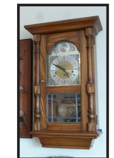
- Trend oak case wall clock