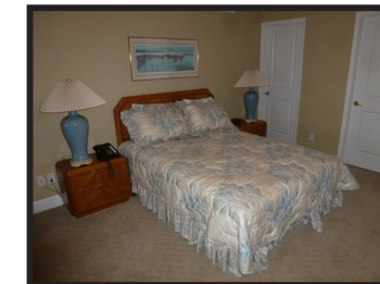
- 5 piece oak queen size bedroom set by Stanley; bed complete, chest type wardrobe, dresser with mirror & 2 nightstands, nice