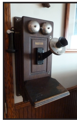
- Western Electric oak wall telephone