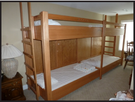
- 2 custom made 13' double bunk beds, oak, handmade, sleeps 4