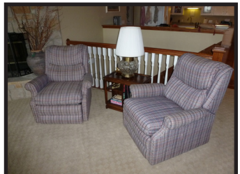
- 2 Century, plaid cloth recliners, same as new