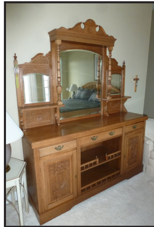
- Oak carved sideboard with bevel mirrored top, 6' long by 7' tall by 19" deep, beautiful piece