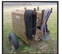
-1964 Jetapower power plant, trailer type, diesel, Hercules, AC Brushless Generator, single & 3 phase, Corps of Engineers US Army unit