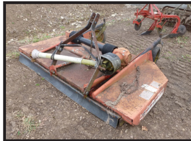
- Bush Hog, 3 pt, 7', offset brush hog