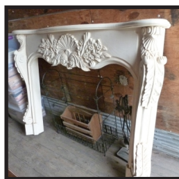
- Ornate fireplace mantel