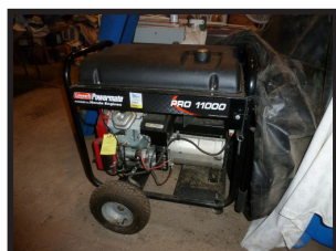
- Coleman Power Mate Pro 11000 generator with Honda engine, same as new