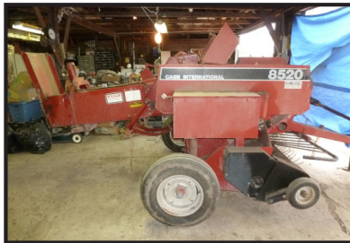
- Case IH 8520 string tie, small bale, hay baler