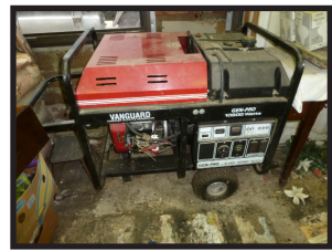
- Vanguard Gen-Pro 10500 watt powered, Gillette generator, like new