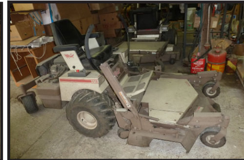
- 618 Grasshopper zero turn lawn mower with Curamax 52" deck, gas only 631 hrs.