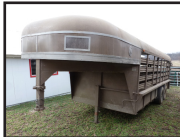
- 1980 Rawhide 20' gooseneck stock trailer with 9,000 lb. axles, nice trailer