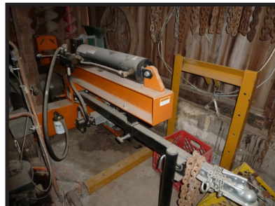
- 34 ton Brave portable wood splitter