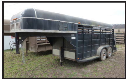
- 1978 – 14' gooseneck stock trailer, good condition