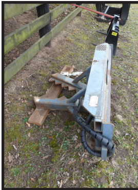
- Arrow tree puller