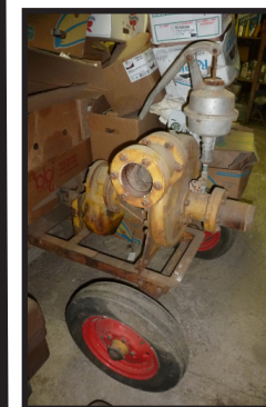
-Model TT-20-30 PTO type water pump by Construction Machinery Comp. Iowa