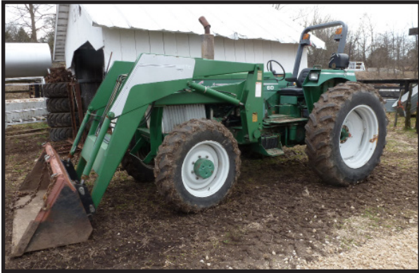
- White American 60, 4 wheel drive, open station, 5.9 Cummins diesel tractor with 16.9-34 tires, triple hydraulics, PTO with roll bar, sells with White 1170 hydraulic front end loader, shows 2918 hrs, extra clean