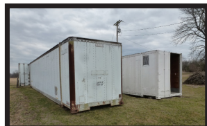
- 2 – 1988 Monon box trailers, 48' long x 102" wide x 9'6" tall, used for storage, good trailers, box only