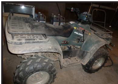
- 2002 Sportsman 700 Twin Polaris True on Demand 4 wheeler, 4 wheel drive, automatic with title, nice bike