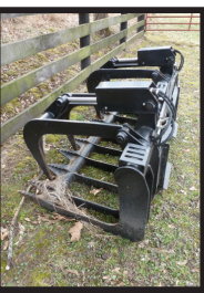
- Hydraulic grapple, looks new