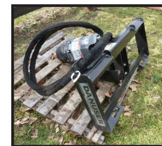
- Danuser EP 15 posthole digger with 12" auger, looks new