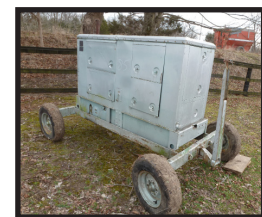
- Hobart portable welder 250 AMPS – 40 volt, type willys, BSBI, complete unit