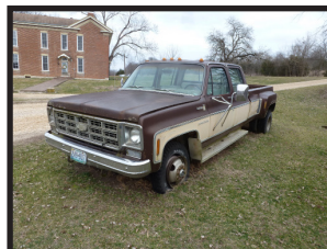
- 1978 Scottsdale 30 dually, crew cab, Camper Special, 6.2 liter, turbo diesel, complete – AS IS