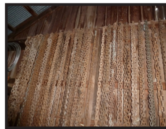
- 30+ log chains, various lengths