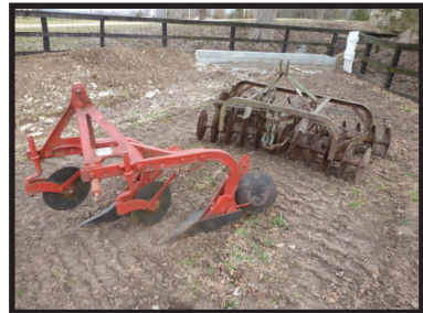
- Dearborn 3 pt. 2 bottom plow