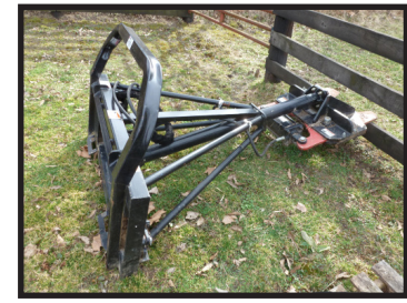
- Precision Hyreach tree clipper, Model XD 6351, looks new