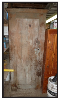
- Primitive pine, 1 door wardrobe with washed buttermilk paint, early piece