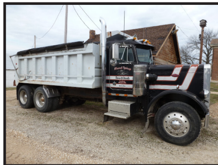
- 1980 Peterbilt tandem dump truck with 15' bed, 13 speed with 400 Big Cam Cummins, road ready with tarp, nice truck