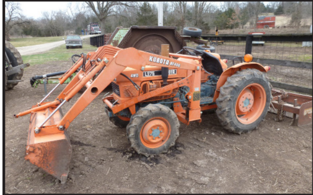
- Kubota L275, 4 wheel drive tractor, 3 pt with PTO, sells with BF400 Kubota loader, shows 999 hrs.