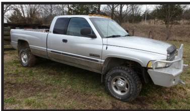
- 2001 Ram 2500 Dodge SLT Laramie extended cab truck, with Cummins 24 valve turbo, diesel, 4 wheel drive, 6 speed manual, new clutch & transmission, 223,2xx miles, silver color, nice truck