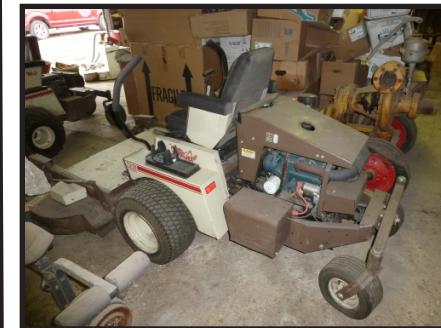
- 721D Grasshopper diesel zero turn lawn mower with SL61 mower deck, only 581 hrs.