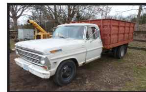
- 1968 Ford 350, 1 ton with 360 V-8, custom cab with 12' bed & hoist, new Detroit locker rear end, shows 76,380 miles