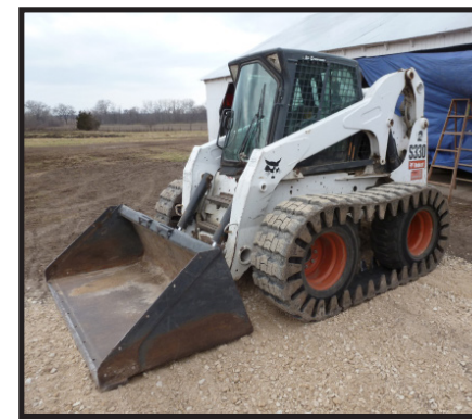
- 2007 Bobcat S330, 2 speed with cab & air, diesel – Power Bob – Tach with rubber tracks, only 127 hrs.