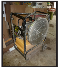
- Val 6 Infrared portable oil heater, like new