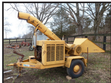
- Chipmore trailer type chipper/shredder, self feed with Ford gas engine & extra chains, nice unit