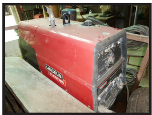
Lincoln Electric Ranger 250, shows 1030 hrs, K1725-7, 10954, U1030601335, CT Chopper Technology, nice set