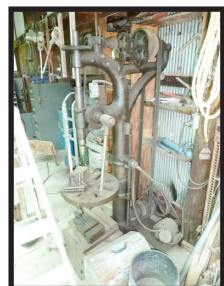
Floor model, belt driven drill press