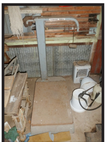
Fairbanks Morse platform scale