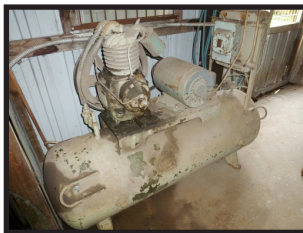
3 phase, 5 hp air compressor