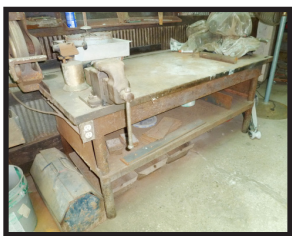
6'x33" welding table w/ 1 1/2 in. steel top