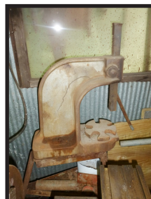
Dake Aubor press on stand