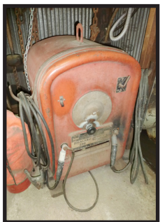
Idealarc 250 Lincoln welder