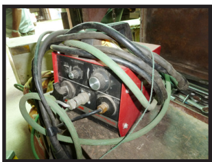
Tig Magnum welder, SG control module, spool gun