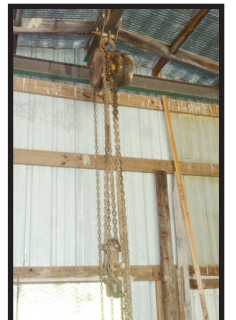
Commercial chain hoist