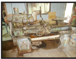
LeBlond lathe, floor model, spindle speed w/42" bed, 3 phase, chuck & accessories