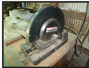
Metal Devil, 14" metal cutting saw w/diamond notched blade