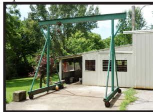
Chain hoist on portable crane type frame