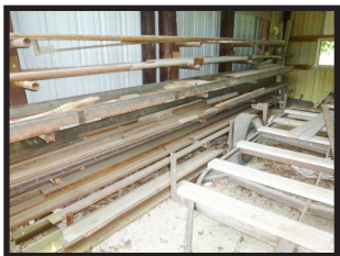
Lot steel; flat iron, square tubing, I-beams, pipe, rectangular tubing, etc.