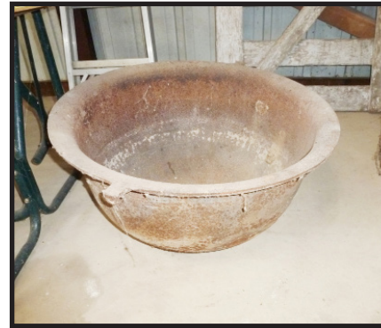
Large cast iron kettle