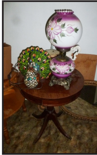
Gone With The Wind parlor lamp