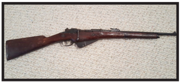
M16 bolt action