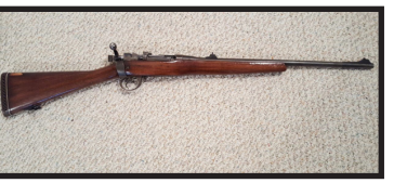
30-30 bolt action