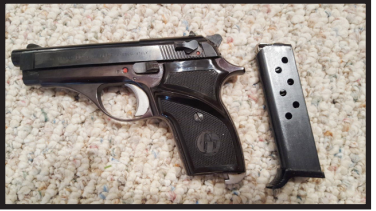
Targa Motel GT 32, 32 automatic

- 30-30 Marlin - Steven Model 59A, 410 bolt action