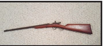
2, 22 bolt action