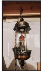
Retro rain hanging lamp