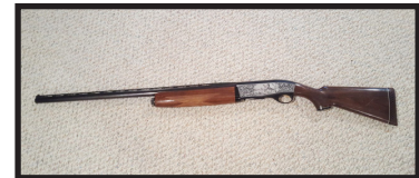
SKB 12 ga. automatic