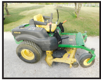
John Deere Z425, zero turn, EZ Trak, 23 hp, lawn mower w/50" cut, only 192 hrs.

- MTD 14 speed, 18 hp riding lawn mower w/46" cut - Ranch King Pro 16.5 hp riding lawn mower w/42" cut