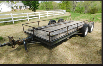
1995, 6'x14' tandem axle trailer w/ball hitch

- 2006, 52"x100" single axle trailer w/rear drop down ramp - 2002, 2 wheel, single axle trailer - Pickup bed trailer