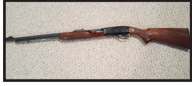
22 Remington, automatic