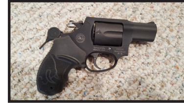
Taurus Ultra Light, Model 85, 38 cal., new