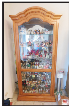
Large, pine curio cabinet full of salt & pepper collection