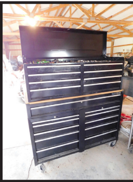
Husky, 18 drawer, heavy duty, 53", 2 pc tool chest, nice piece