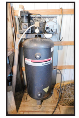
Black Max 6250, 5000 watt, portable generator