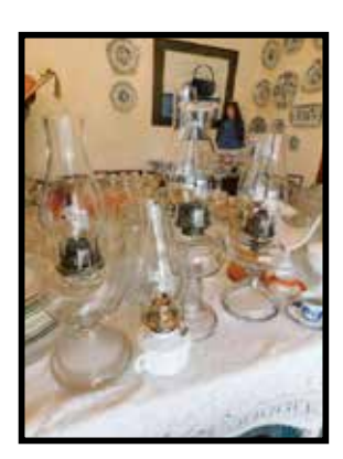
6 oil lamps, 1 finger lamp