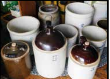
3 & 5 gallon jugs