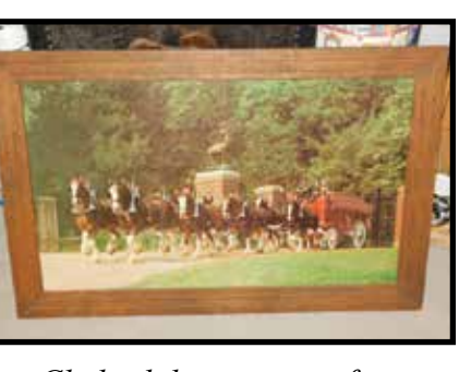
Clydesdale picture in frame