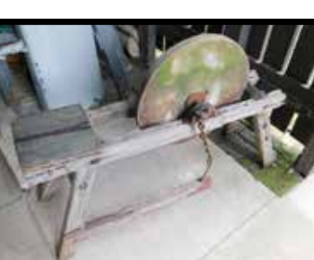
Primitive grindstone on seated stand