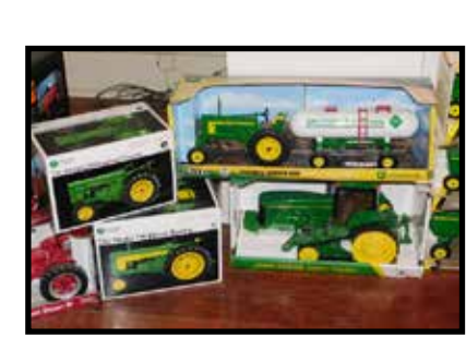
John Deere manure spreader, blade, front end loader, log skidder, 20 pedal tractor, Anhydrous Ammonia wagon, 550 Mulch Master.