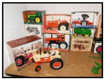
Fox Fire, The Last Cowboy, Case NIB