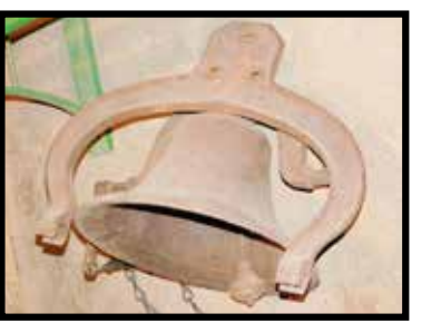
Crystal City #2 dinner bell w/voke