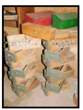
Lot wooden yeast boxes