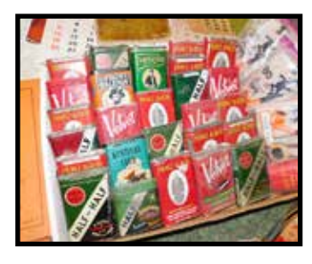
Lot tobacco tins