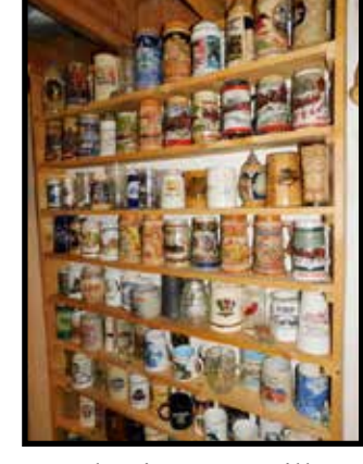
- Budweiser - Miller - Falstaff - Etc.