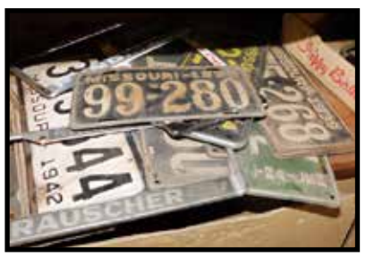
Lot license plates; 1930's, 40's etc. some sets