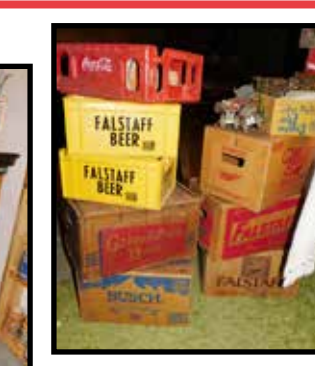
Busch, Miller, Griesedieck. Falstaff cardboard beer cases