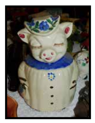
Winnie cookie jar