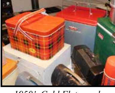
1950's Cold Flyte cooler