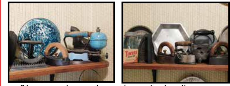
Blue enamel, gas, charcoal, wooden handle, ornate handle & fluting irons

Gibson CF 100E guitar with case, bought used in 1963