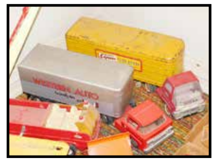
Western Auto box van truck