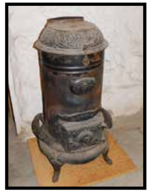
Bridge Beach & Co. St. Louis Superior Hot Blast wood heating stove