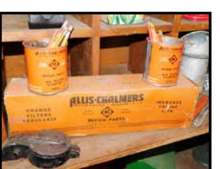
Allis Chalmers Repair parts paper box