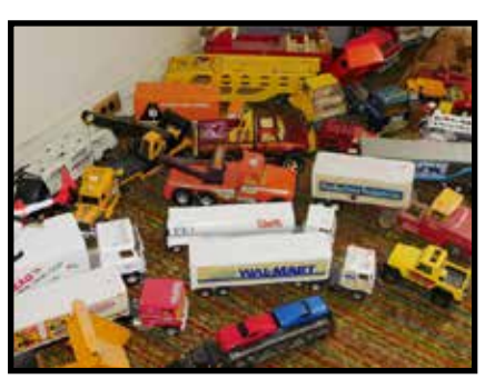
Walmart tractor trailer

- Van Lines truck & trailer - Pet Cream tractor trailer