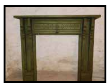
2 wooden fire place mantels, 1-spoon carved