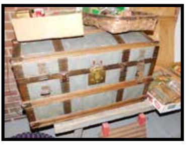
Camel back oak trim trunk