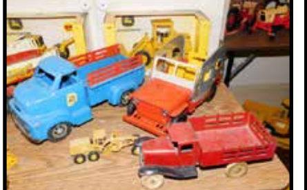
1950's Willy's Jeep w/lights