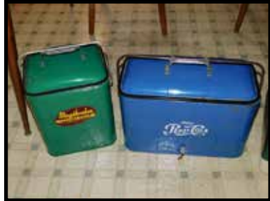
1950's Pepsi Cola cooler