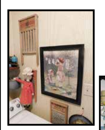
Lot picture frames, 1 child hanging laundry