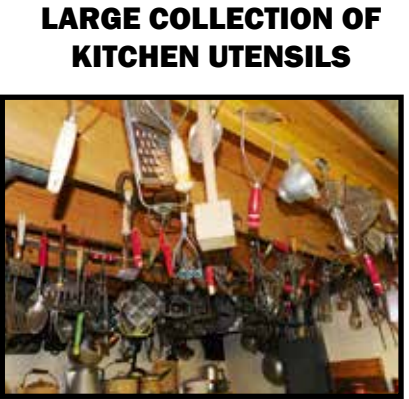
Red handle, green handle, beaters & any type of utensil – approx. 150+