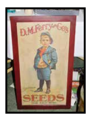
D.M. Ferry & Co. Seed advertising