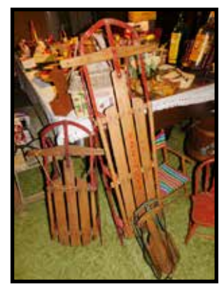
King of the Hill sled