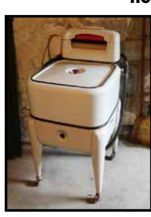
Maytag wringer washer, runs extra clean