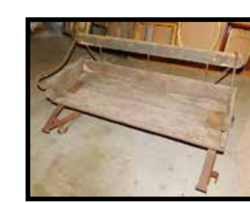
Spring wagon seat, Walter Faith Farm