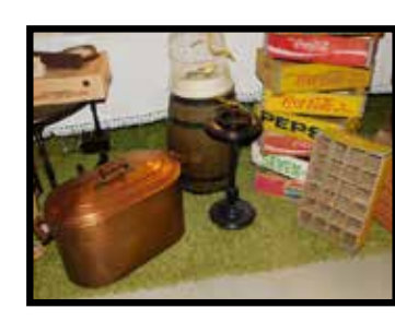
Copper wash boiler