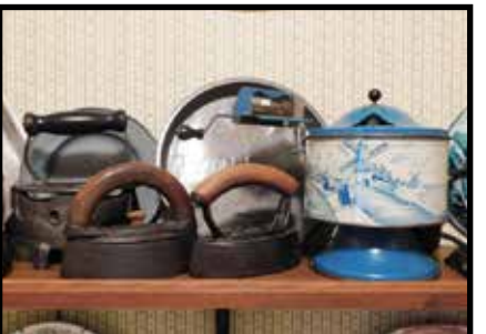
Tin wind up washing machine

- Van Lines truck & trailer - Pet Cream tractor trailer