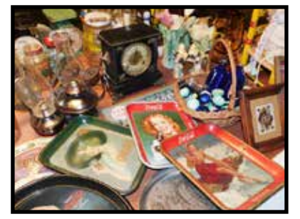
1950's Coca Cola trays