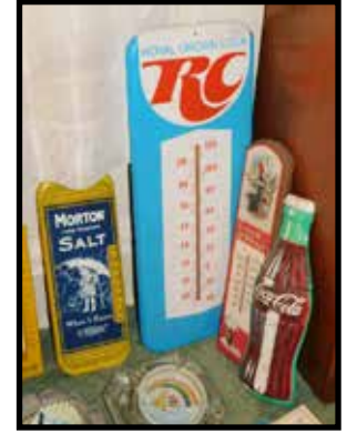
Royal Crown Cola thermometer