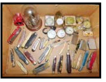
Camel cigarette lighter