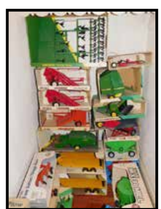
McCormick 1 PR corn picker Ertl NIB