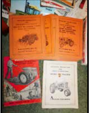
20 AC Manuals, WD 45, implements, etc., like new