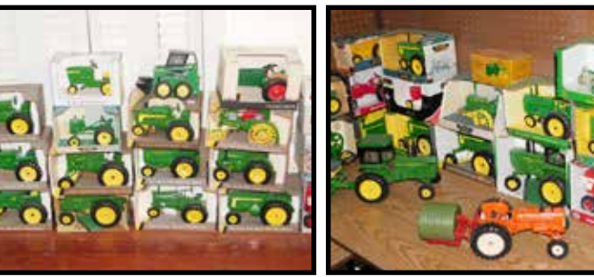
John Deere Tractors; 60, G, GP, 620, 630LP, A, 1928, C, 720, 70 Standard, 730 Diesel, 8400T, 3010, 4010, most Ertl, most NIB. Partial List