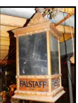
Falstaff Rotary lighted bar light