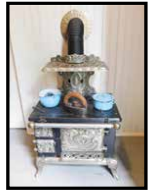
Salesman Sample Buck Stove/Range, cook stove, lot of chrome, very nice piece