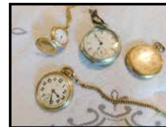
Elgin pocket watch