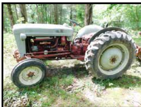
Ford Golden Jubilee tractor, good rubber

ALL FFL LAWS APPLY. ALL OUT OF STATE FIREARM BUYERS MUST PRESENT A CURRENT FFL LICENSE. NO EXCEPTIONS