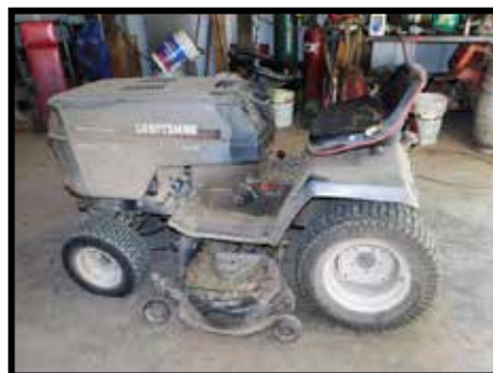
Craftsman HD garden tractor w/Kohler 18 hp motor, 6 speed w/44" cut