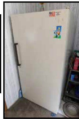
Whirlpool upright freezer