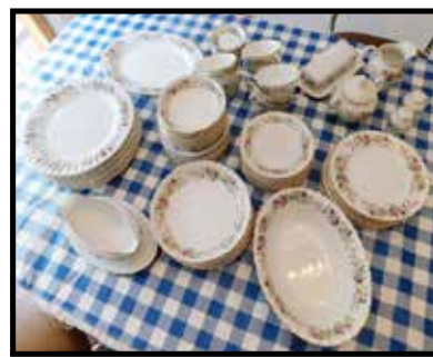
Set Creative Regency Rose, fine china, service for 8 w/accessories