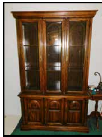
Oak, 3 door china cabinet