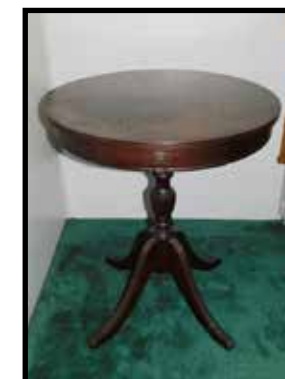
Duncan Phyfe, lion head, drum table