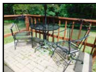
Black wire mesh patio table, umbrella & 2 chairs, like new