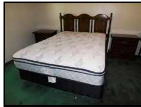
5 pc, oak frame bedroom set; bed complete, dresser w/mirror, chest & 2 night stands, nice set