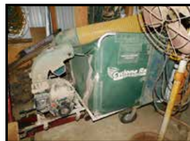
Cyclone rake, leaf vac system, trailer type w/6.5 engine