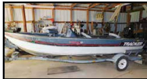
1990 Tracker Pro Deep V, fishing boat w/ Tracker Trail Star trailer & 1992 Johnson Tracker, 40 hp outboard motor