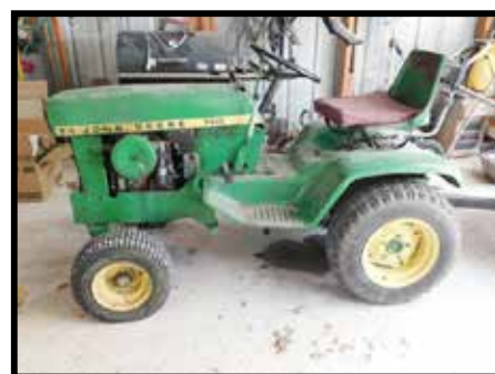
John Deere 140 riding lawn tractor