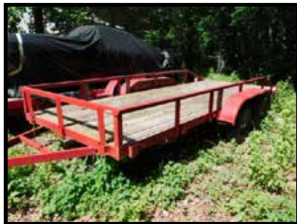
1990 homemade 70"x16' tandem axle, flatbed trailer w/title