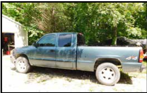
2007 GMC Sierra, 4x4 extended cab pickup, automatic, air, high miles, clean