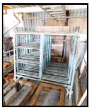
26 pc. large scaffolding