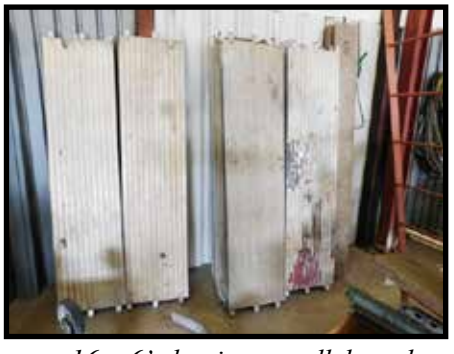
16 – 6' aluminum walk boards. for scaffolding