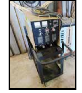
Hobart Invector DC electric welder