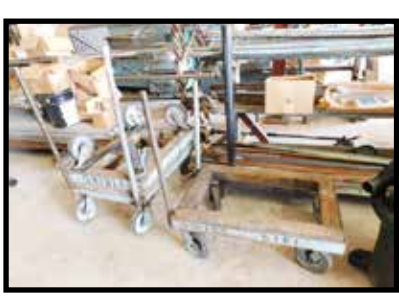
4 trolleys, 8"x8", 3 ton, 1 - 5 ton