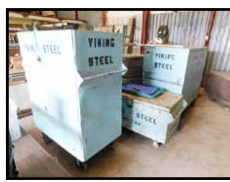
Steel gang boxes; 4', 5' & 6' on castors 1-28" T, 1 – 57" tall, 1 - 64" tall