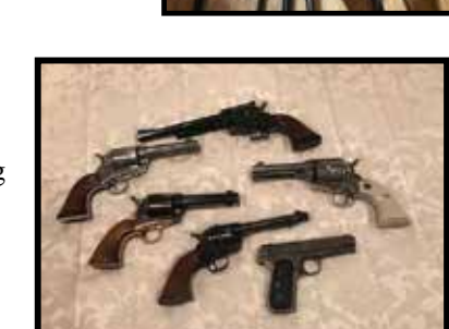
Colt 1903 pistol, .32acp