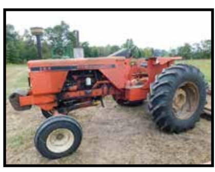
Allis Chalmers 185 diesel tractor, open station & wide front end, 18.4-30 tires, shows 3,694 hrs