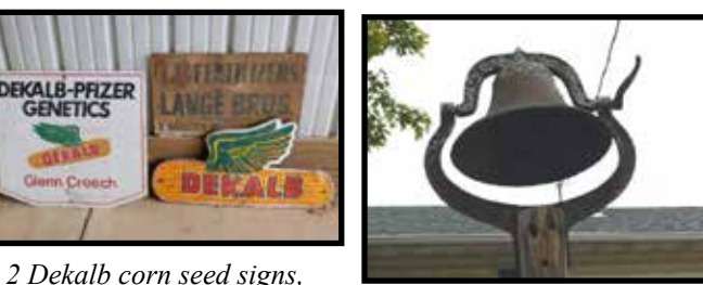
Dinner bell w/yoke