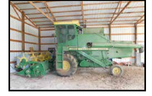
1975 John Deere 4400 diesel combine w/ cab. SN 155536H. 23.1-26 tires, sells w/JD 213 Plat Form & JD 444, 4 row corn head, kept in shed, clean