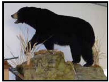
Full body black bear mount, nice