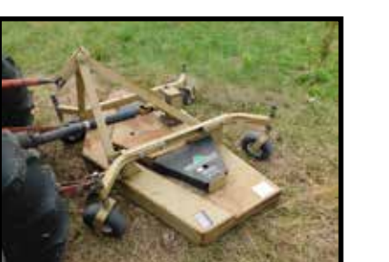
Land Pride AT 2572, 3pt. finish mower w/side discharge, good