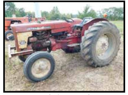
International 424 gas utility tractor, open station & wide front end, 14.9-28 tires, SN 13448, shows 3,176 hrs

- Cub tractor, wide front end w/cycle mower, restoration piece, AS IS