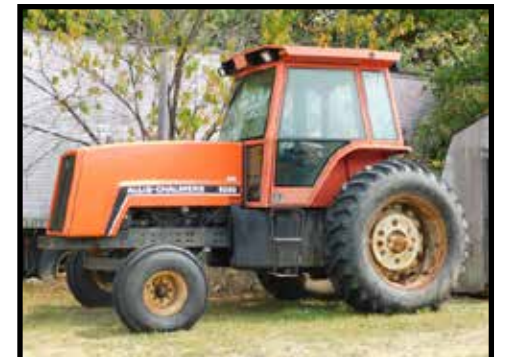
1980's Allis Chalmers, 8030 diesel tractor w/cab, 18.4-38 tires, 3pt., dual hydraulics, shows 2,883 hrs, 133 hp, extra clean