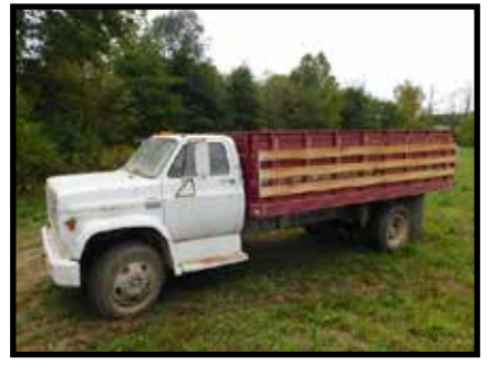
1976 GMC Sierra 6000, V- eight 2 ton grain truck, 4 speed w/2 speed axel, 16ft combination grain bed & hoist, shows 22,364 miles, kept in shed