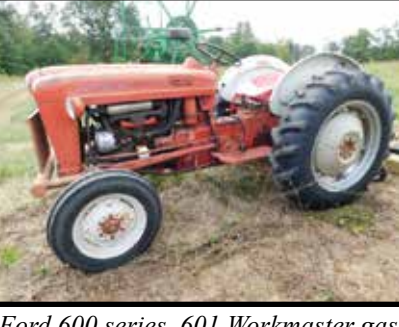
Ford 600 series, 601 Workmaster gas tractor with wide front end, new 12.4-28 tires, good tractor