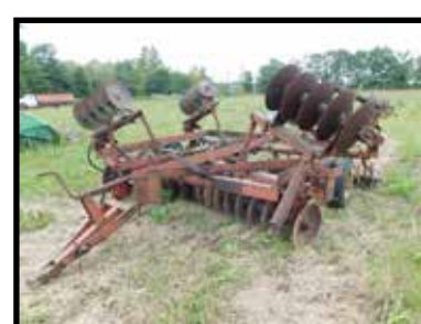
IH Model 475, 16' manual fold wheel disk