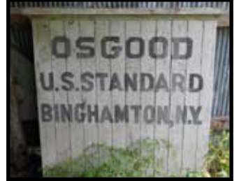
O S Good US Standard farm cale, Binghamton, NY advertiser Western, 4 gallon stone jar