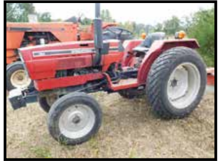
International 254 diesel tractor. 3pt.. wide front end, PTO, shows 1,528 hrs, sharp