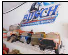
Tonka & Nylint; trucks, wrecker, etc.