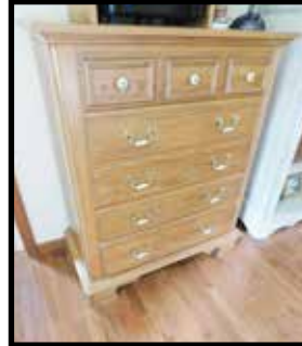
Oak chest of drawer & nightstand