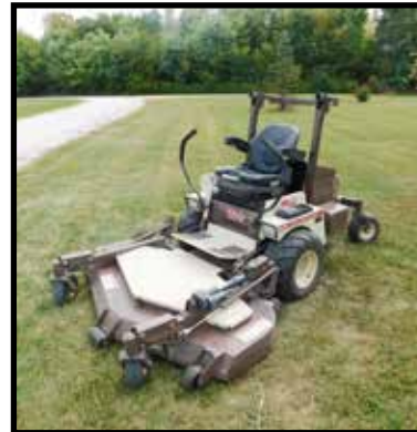
Grasshopper zero-turn mower, 725 Max Torque, diesel w/pow-fold Dura Max, 61" deck & air ride seat, bought new, 524 hrs, nice