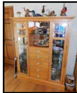
Solid oak, lighted curio/buffet by Cochrane, very nice piece