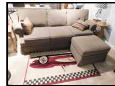
3 cushion sofa, ottoman & side chair, off brown, nice