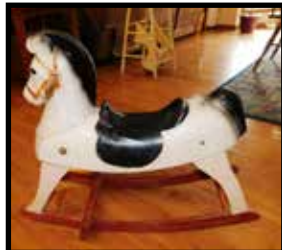
Child's horse rocker