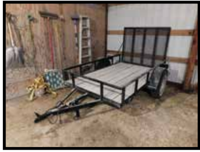
1998 Trailerman, 5'x8' single axle trailer w/3500 lb. axles, drop ramp gate & 15" tires, nice trailer