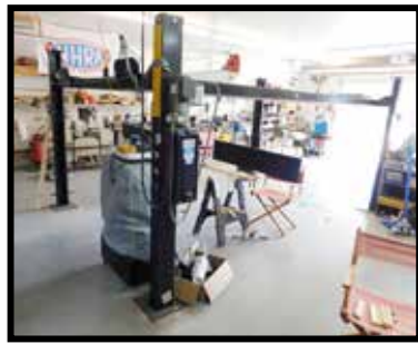
Jeg's 4 post car lift, 7000 lb. capacity, like new