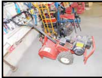
Snapper 4 hp, 16" rear tine tiller