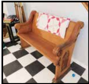
5' church pew, nice piece