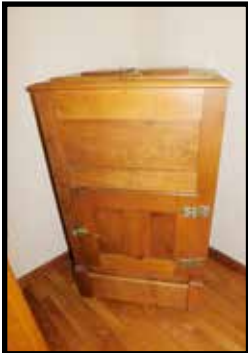
Oak 1 door ice box w/lid, nice piece