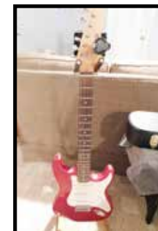
Red Austin electric guitar