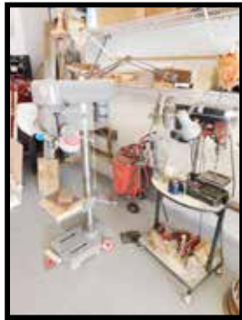
Rockwell floor model drill press