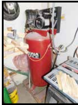
Magna Force 5 hp, upright air compressor