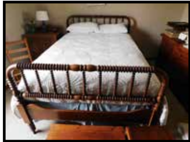
Jenny Lind, full size bed, complete