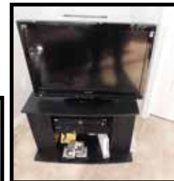
Dynex 32" flat screen TV & stand