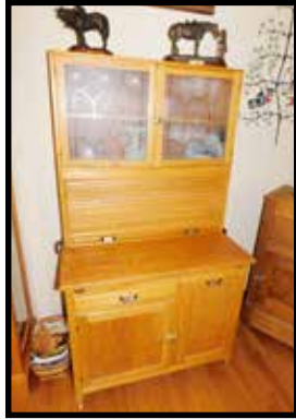
Oak bakers cabinet w/ etched glass doors, roll top bin w/pull out cutting board & flour container, very nice piece