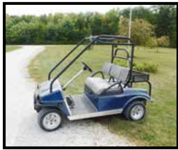
2003 Club Car, golf cart, gas w/rear basket, roll bar & chrome wheels by M&M Golf Cars, nice