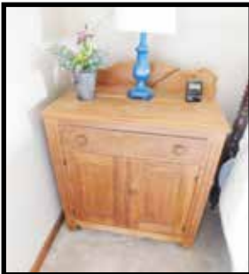
Walnut Eastlake washstand