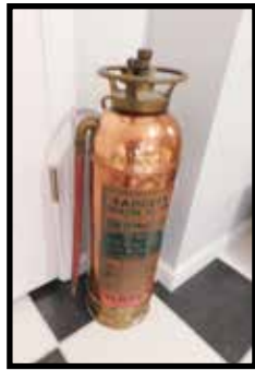
Brass fire extinguisher