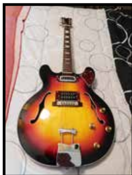
Electric Hollow, lap steel guitar