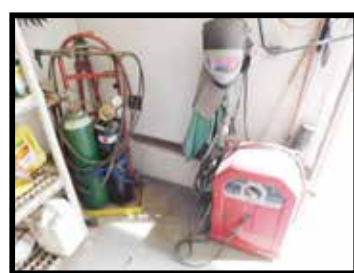
Acetylene set, complete w/tanks & cart