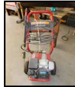
Troy Bilt pressure washer