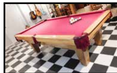
AMF Play Master, oak frame, slate top, regulation size pool table, like new, complete w/balls & cue sticks