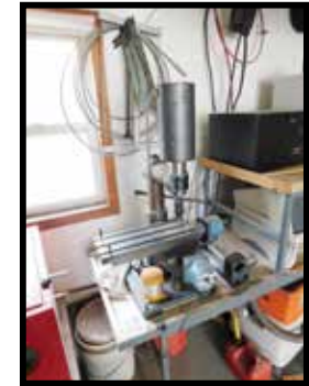
Terco milling machine w/3 XYZ lathe attachments & computer, bench type