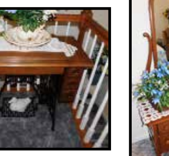
Oak 2 drawer dresser w/tall mirror