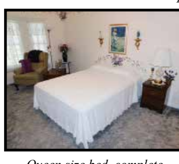
Queen size bed, complete