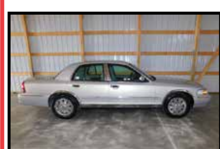
2008 Mercury Grand Marquis GS bought new, only 66,312 miles, 4