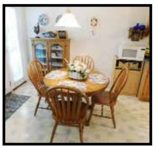
Modern, round oak pedestal type, dining room table