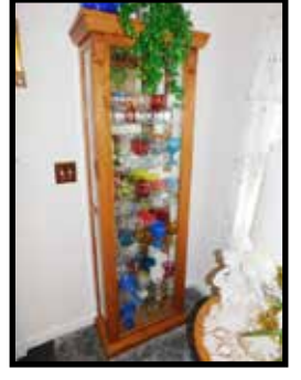
Oak 6 shelf curio cabinet