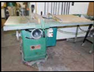
Grizzly Model G 1023, 10" heavy duty table saw w/workstation