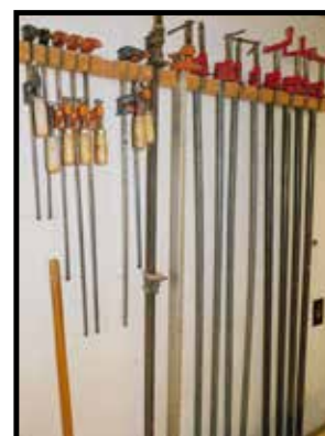
8 - 48" pipe clamps