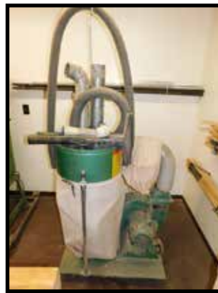
Grizzly Model G 1028- 1029, 2hp dust collector