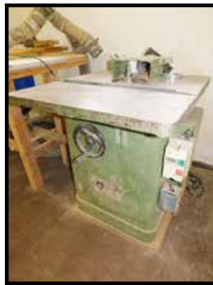
Grizzly Model G 1026, 3hp shaper