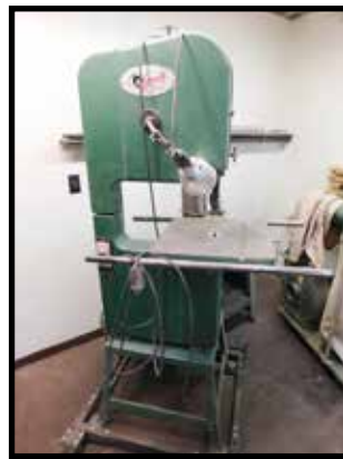
Grizzly Model G 1073, 16" band saw, floor model