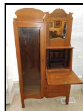
Oak drop front secretary, nice