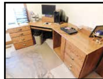
Oak 3 piece corner desk w/printer drawer; built by Ed