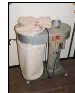
Total Shop dust collector, 1hp