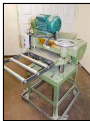
Grizzly Model G 1021, 15" planer