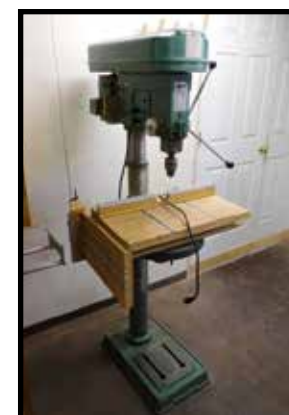
Grizzly Model G 1201, 9 speed drill press, floor model