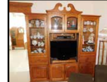
Oak 3 piece entertainment center w/glass door curio cabinets; built by Ed