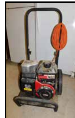
Coleman Powermate 3750, 6 hp portable generator