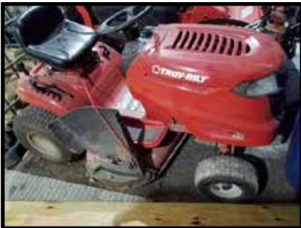
Troy Bilt, 7 speed pony lawn mower, 42" cut