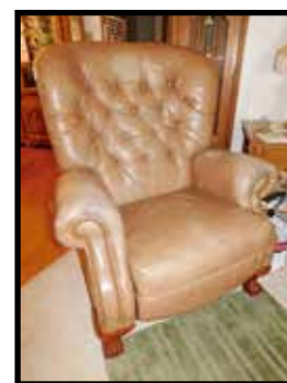
Lazy Boy oversize tan leather recliner w/claw feet, very nice