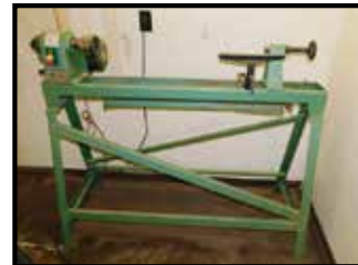
Grizzly 14"x40" wood copy lathe, floor model