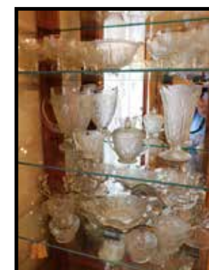
Iris pattern glassware; bowls, vases, sherbets, pitchers, candle stands, sugar, creamer, etc.