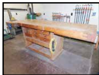
36"x100" woodworking table w/clamps & shelving