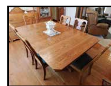
Oak dining room table w/2 leaves, 6 oak chairs w/cloth seats, beautiful set; built by Ed