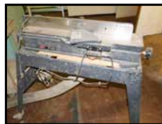
Craftsman Model 113, 8" joiner planer