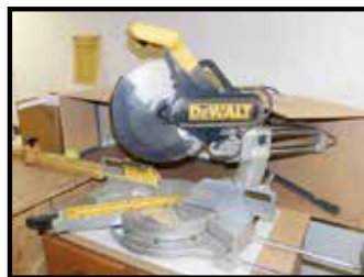
DeWalt Model DW 708, 12" compound miter saw