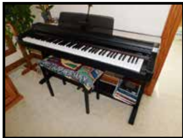
Kawai 500 digital piano w/ bench, nice

- Train sets, accessories, track; large collection