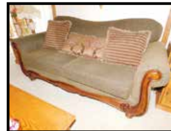
Living room 2 cushion sofa, chair & ottoman, very nice