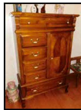
5 piece massive queen size bedroom set; high back bed complete, dresser w/mirror, armoire, chest & 2 night stands, very nice set