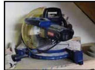
Ryobi TS 1341, 10" compound miter saw