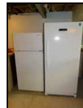
Large capacity white up- right deep freeze, like new & Kenmore refrigerator