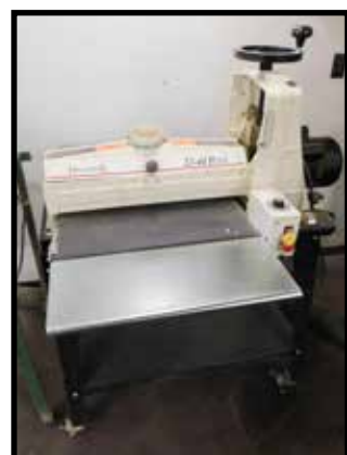
Performax 22-44 Plus drum sander, 1 3/4 hp on stand