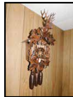
Black Forest cuckoo clock