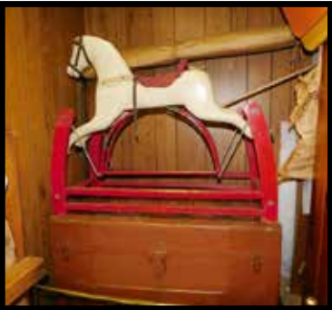
Early child's wooden rocking horse