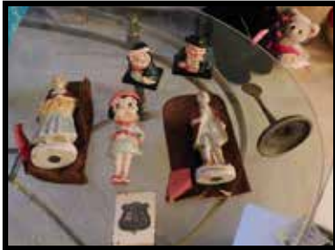
Betty Boop, Fleischer Studios doll