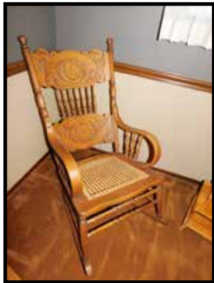
Ornate oak pressed & spindle back rocker