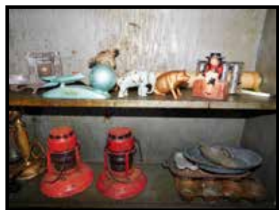
Farmers Market Pittsfield, Ill. Rocket & Moon mechanical bank, cast elephant, Fido, Pig, Jr. Safe Deposit, barrel of money, mailbox