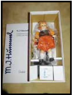
M.J. Hummel Ean school girl #1066, Hum 521 in box