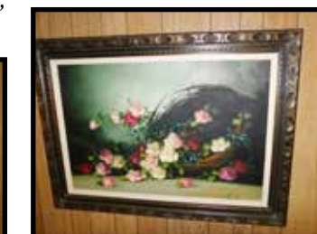
Roses oil on canvas, by Teruel