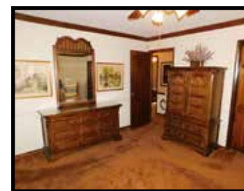
Dark pine, 5 pc bedroom set; bed complete, dresser, chest & 2 nightstands