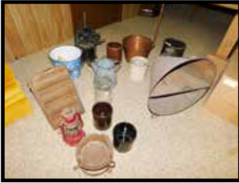
Early tin bread maker & mold