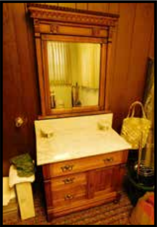
Walnut washstand w/ white marble top & mirror, nice