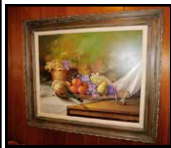
Salvatore Langella "The Still Life" oil on canvas