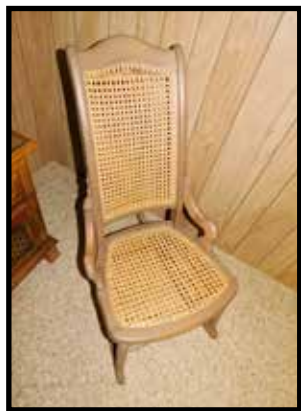
Walnut, Lincoln style rocker w/cane seat & back