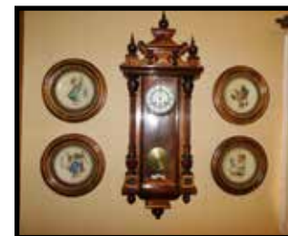
Gustav Gerber wall clock, very elegant