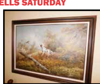
Hoffman oil on canvas, bird dog hunting scene