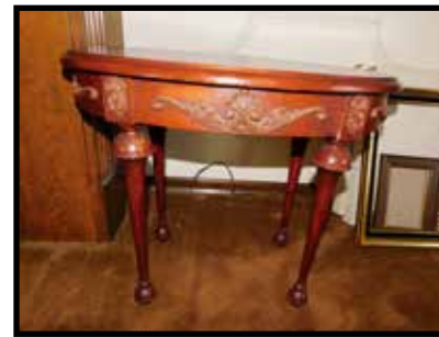
4 leg, ornate parlor table