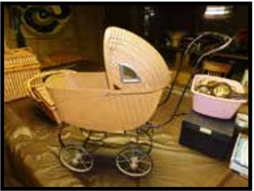
Twin baby carriage