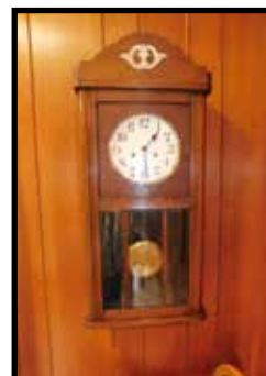
Becker oak wall clock