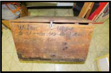
Weber wooden shipping box, St. Charles, MO, Millet, neat piece of history