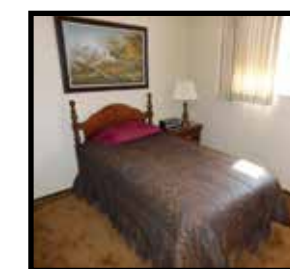
7 pc. dark pine bedroom set; single bed complete, dresser w/mirror, secretary desk w/chair, bookcase, chest & 2 nightstands