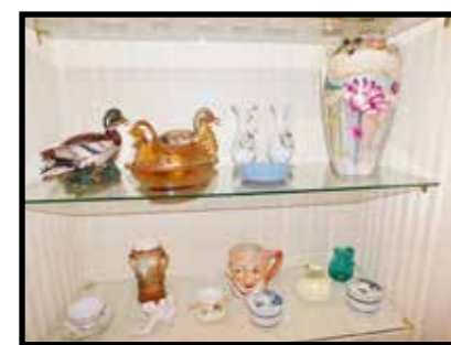
2 handled, hand painted Royal vase, approx. 12"