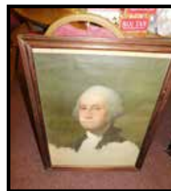
George Washington portrait in frame