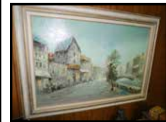
Willi Bauer oil on canvas, street scene