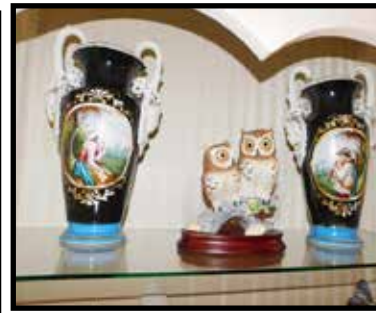
Set Victorian, 2 handle vases, approx. 14" tall, Victorian man w/bagpipe & lady, very old set, #1765-4