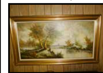
B. Groveman, "Little River" oil on canvas