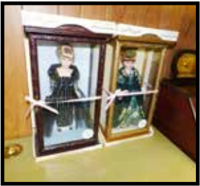
2 Camellia Garden, 16" genuine porcelain dolls w/boxes