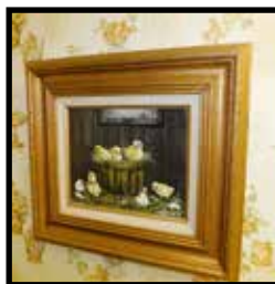
Oil on canvas, Chicks, by Ganes