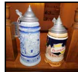
1971 Falstaff collector stein