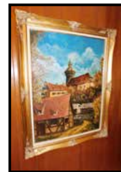
W. Hofman, 1965 oil on canvas, Castle at Nuremburg