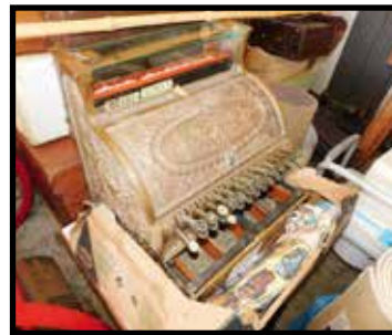
Brass cash register