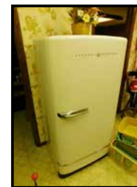
1940s - 50s GE refrigerator, white, works, extra clean