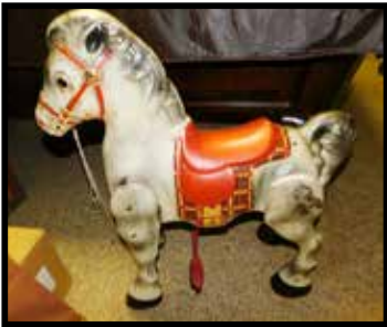
MoBo tin bouncy horse