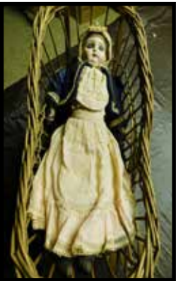
Daiai porcelain head doll, open mouth w/teeth, open eyes, comp. body w/ wooden wheel doll buggy, complete w/ clothes & shoes quilt, bought in early 70s, on the Dabrect family sale in St. Charles