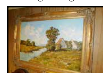
Sohn oil on canvas, Country Scene, 2 Houses