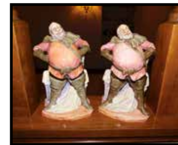
Falstaff Royal Doulton HN2054