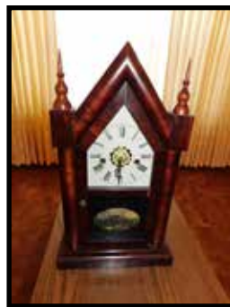
Waltham steeple clock, shelf type w/ painted screen on door