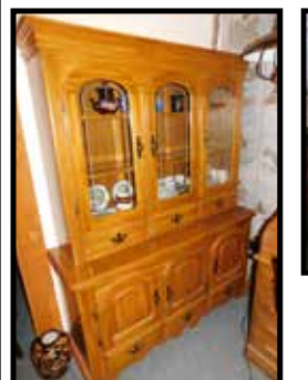
China cabinet hutch