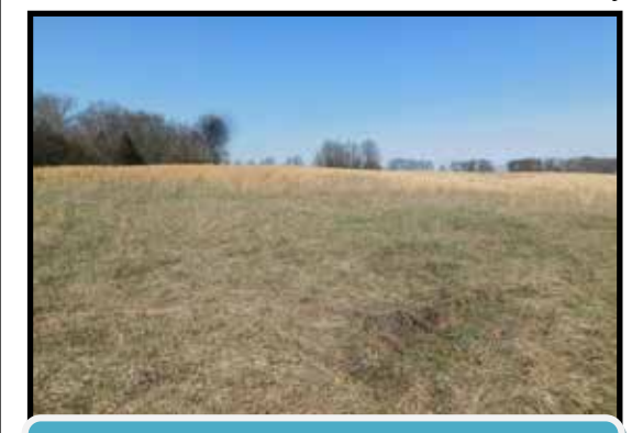
NOTE: Gary's mom and dad bought this farm in 1970 and it has been in their family since.

TRACT #2: 30 acres m/l lays north of TRACT #1. Approx. 25 acres in hay, could be farmed.