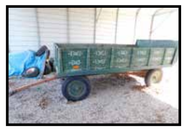
12'x6 1/2' farm wagon, pin hitch, lights wired for road use(hayride wagon), 4 prong

- 11'X49" light duty homemade trailer w/ramps, holds 2 4 wheelers, removable sides, w/title - Craftsman garden 2 wheel dumpcart - Rubber tired chuck wagon, as is