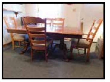
Rectangle oak table, 72"x42" w/5 chairs(1 armed)