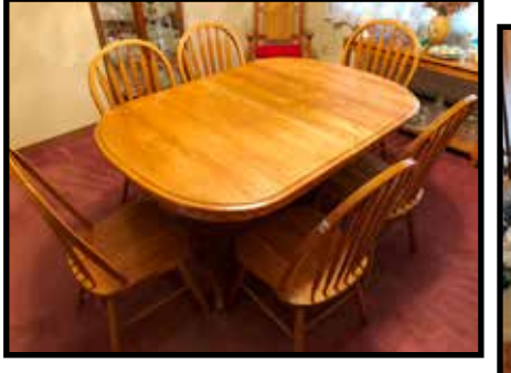
Oak dining room table w/leaves, 6 spindle back oak chairs, very nice set