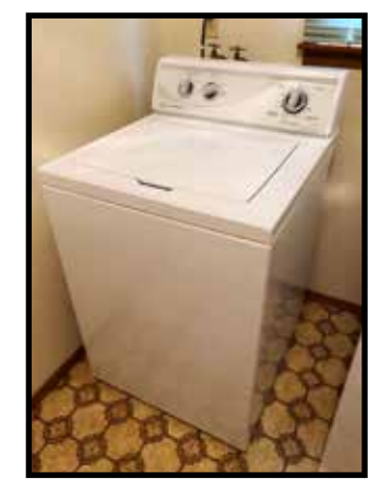
Speed Queen, automatic washer, commercial, heavy duty, super capacity plus, like new. white