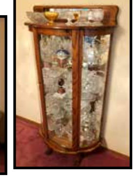
Oak. 1 door curio cabinet , nice