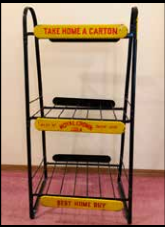
Take Home a Carton Roval Crown Cola floor display