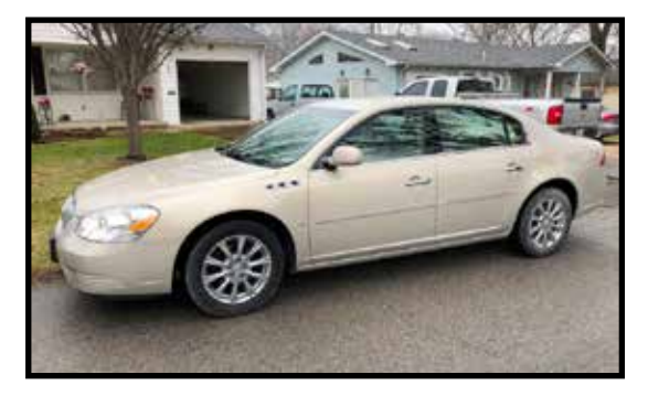
2009 Buick Lucerne CXL, flex fuel, 4 door automatic, front wheel drive, leather interior, loaded, one owner, only 41,245 miles, kept garaged, super clean