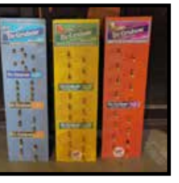
Dr. Grabow pipe display, store type