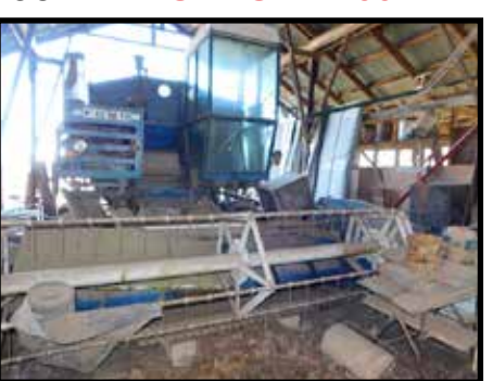
Ford 622 combine w/cab, 10' platform & 2 row corn head, parked in shed