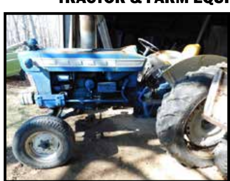
1969 Ford 5000 diesel tractor, 3 pt. single hydraulics, wide front end