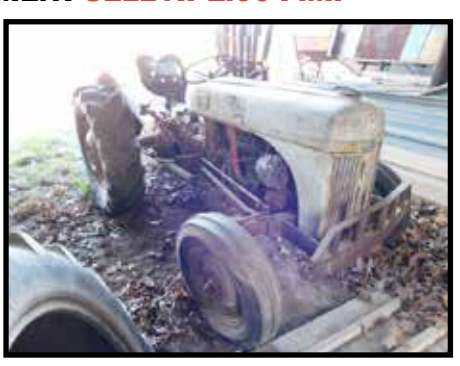
Ford 8N tractor