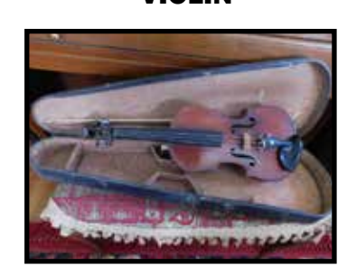
Antonius Stradivarius Faciebat Anno 70 violin w/ wooden case, Melvin's dad's

LARGE COLLECTION SHEET MUSIC Black Memorabilia, Patriotic, Christmas, Religious, Etc.