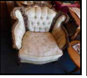
1940s heavily carved, Lot Country Rose china w parlor armed chair several side pieces