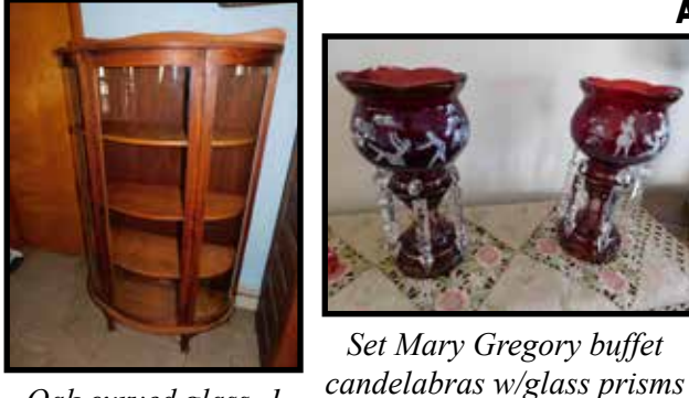
Oak curved glass, 1 door china cabinet