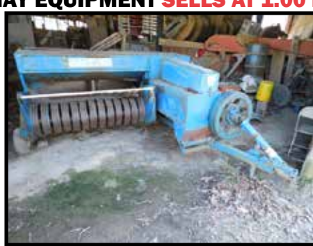
Ford 532, string tie hay baler, kept shedded