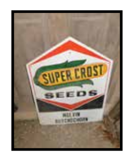
2 Super Crost seed corn, metal advertising signs