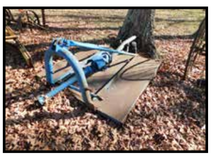
Ford 3 pt, 5' brush hog