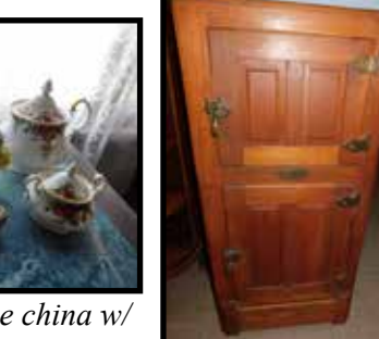
Belding Hall Century, oak 2 door ice box, nice pc