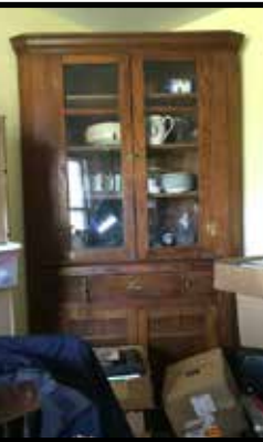
Pine 7ft. corner cabinet, super piece

40-50+ Pieces - Most Colors – Cereal to Bread Size - Redwing, Etc.