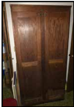
Oak 2-door linen cabinet, 5-shelf (Alumni Chapter Kappa Alpha Theta)