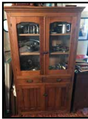
Oak kitchen cabinets