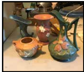
Roseville pottery, 4 pieces