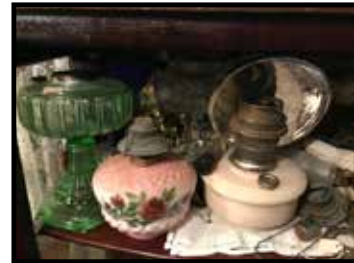
5 Aladdin lamps: green depression, cobalt blue (repo), pink, metal, etc., Lincoln Drape