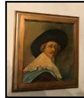
Oil on canvas, Old Rabbi in frame