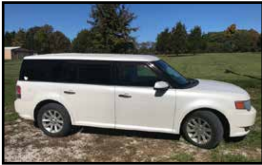
2012 Ford Flex SEL white 4 door, loaded, one owner, 86,000 miles, nice (this is Judy's car)

40-50+ Pieces - Most Colors – Cereal to Bread Size - Redwing, Etc.