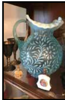
Fenton daisy & fern patterned fluted pitcher