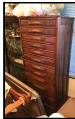
12 drawer oak file or printers cabinet, super store piece