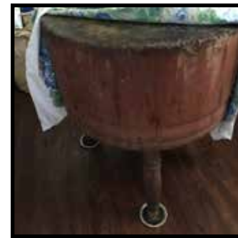
Round, 3 leg, red butcher block, nice piece