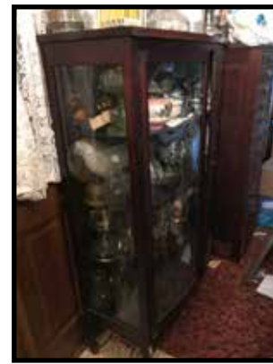
Mahogany 2 door china cabinet