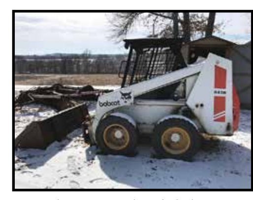
Bobcat 843 B diesel skid steer, rubber tires

- John Deere Van Brunt, 17 hole wheat drill w/grass attachment