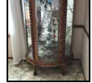
Curved glass 1-door curio cabinet