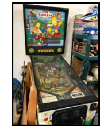
The Simpson's Data East pinball machine, good condition - Galaga MS Pac-Man floor model