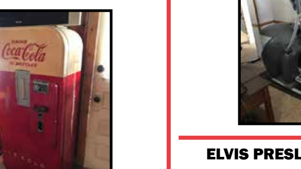
SELLS AT 12:30 P.M.