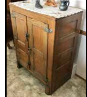
Oak 3-door ice box, super nice pc.