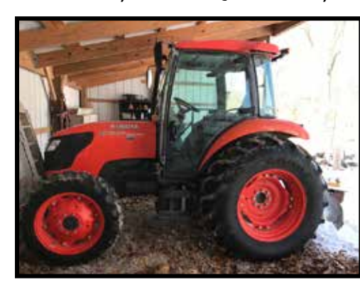
2012 Kubota M7040 diesel tractor. hydraulic shuttle, front-wheel assist, ultra grand cab, 16.9-30 tires, bought new only 396 hrs, same as new - Ford Golden Jubilee model gas tractor, complete, AS IS