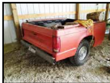
Pickup bed 2-wheel trailer

- 16' bumper hitch tandem-axle trailer, homemade, no title