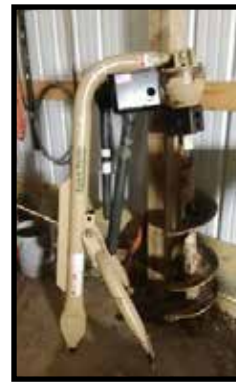
3-pt Land Pride post-hole digger, looks new