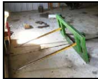
3-pt big bale spear