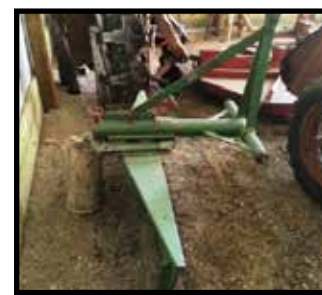
3-pt 6' John Deere blade