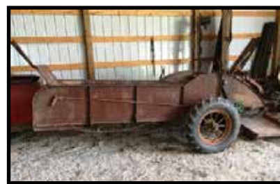
John Deere ground driven manure spreader