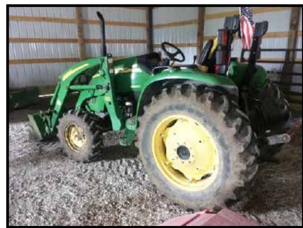
2006 John Deere 4120 MFWD bought new in '07 diesel tractor, open-station, 43-hp, sells with John Deere 400X hydraulic front-end loader w/2 buckets, 2,650-hrs, sharp