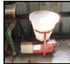
12v grass seeder