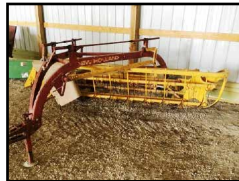
New Holland pull-type hay rake