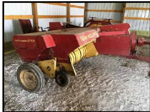
Hayliner New Holland 273 string-tie hay baler