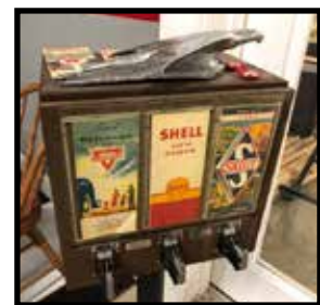
Road map dispenser, 3-unit $2 machine