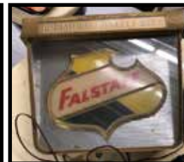
Falstaff Premium Quality Beer lighted sign, 1950's era