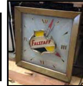
Early Falstaff electric tavern clock