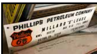
Phillips 66 petroleum company sign, Ector Co. Texas