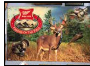
Miller High Life embossed "Friends of the Field" advertising sign