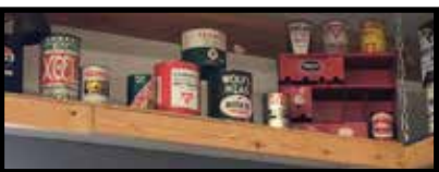
Lot paper oil cans: Sinclair, Skelly, Mopar, Kendall, Quaker State, Etc.