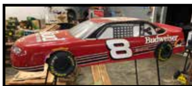
Budweiser Dale Earnhardt King of Beers, 8' Monte Carlo model car advertising