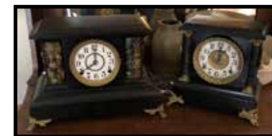
Ingram shelf clock