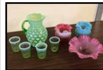
Fenton glass, coin dot pitcher & tumblers set