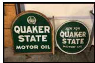
Quaker State Tombstone motor oil advertising sign