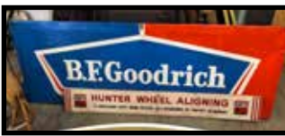
B.F. Goodrich 7'6" metal advertising sign