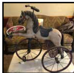
Primitive, wooden 3-wheel horse pedal tricycle