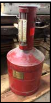
Seraphin Test Measure gas can