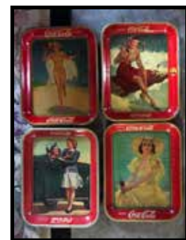
Lot 1930's-40's Coca-Cola soda trays