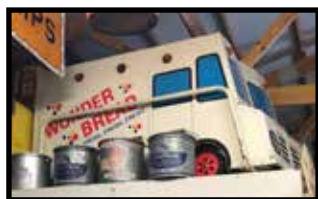
Wonder Bread (lighted) bread truck store display, neat pc.