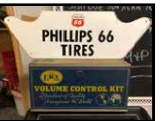
Phillips 66 Tires metal advertising sign, N.O.S.