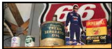
Imperial Motor Oil can