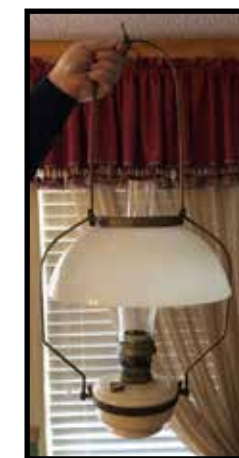
Cream color Aladdin lamp, complete w/shade