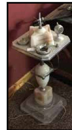
Art Deco Onyx smoke stand, complete