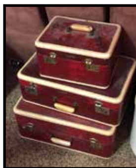
Set 1940's suitcases