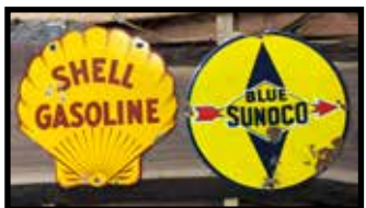
Shell Gasoline & Blue Sunoco advertising signs