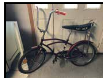
Super MX Union Hi-Riser motocross bike w/book