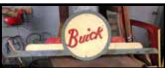
Metal Buick advertising sign