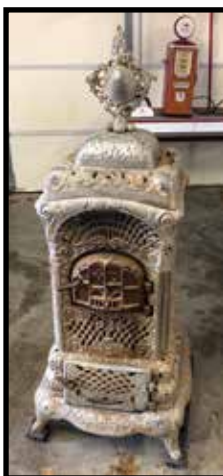
Moore's Air Tight #403 B, nickel plate wood heating stove, very ornate