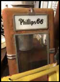
Phillips 66 gas station pump fronts