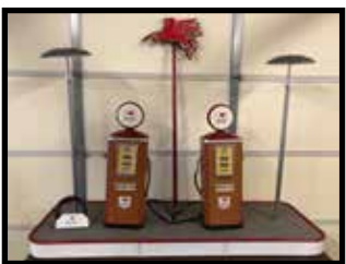
Lighted 2-pc, mini gas pump display, Mobile Gas center island