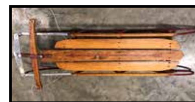
Flex Flyer child's sled