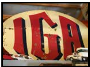
Oval porcelain IGA advertising sign