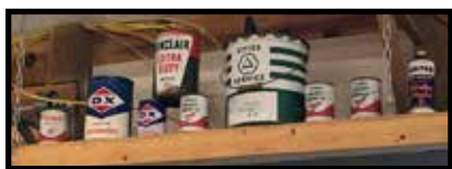
Texaco Aircraft engine oil, N.O.S.