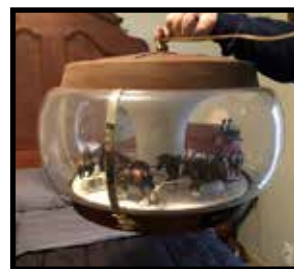
Budweiser Clydesdale team, rotating bar sign, nice pc.