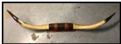
Set longhorn horns

ALL FFL LAWS APPLY. ALL OUT OF STATE FIREARM BUYERS MUST PRESENT A CURRENT FFL LICENSE. NO EXCEPTIONS