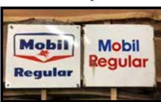
Mobile Regular porcelain signs