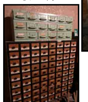
Anderson Metals Corp., Kansas City, MO Fittings 18-drawer metal display