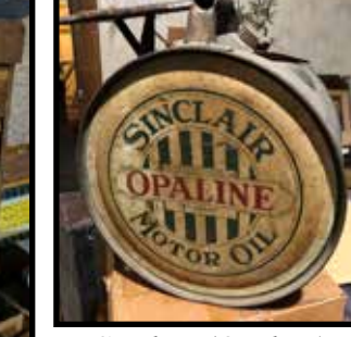
Sinclair (Opaline) motor oil/rocker oil

- Hibbard, Spencer, Barlett & Company, Warranted Cutlery Knife Store showcase, counter-type