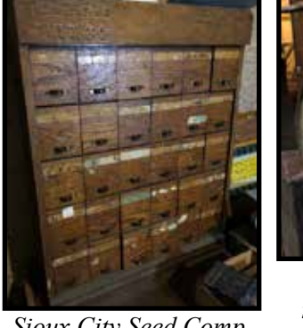
Sioux City Seed Comp. Reliable Seeds, 30-bin seed box