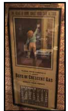
1939 Boys of Crescent Gas advertising calendar in frame