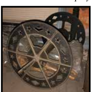
Cast store rope reel, super pc.