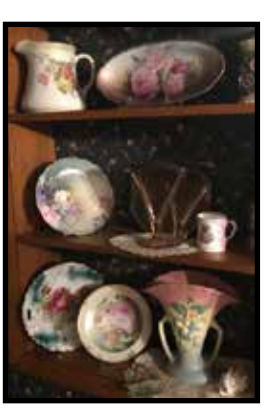
Hull 10 1/2" vase