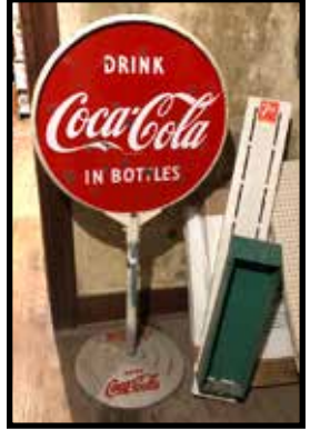
Lollipop/Coca-Cola 2-sided sign w/cast Coca-Cola base (Drink Coca-Cola in Bottle sign), Troy pc.