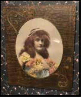
Lot Victorian lady portraits in frames