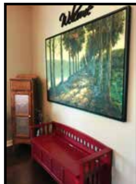
2, Deacon painted benches