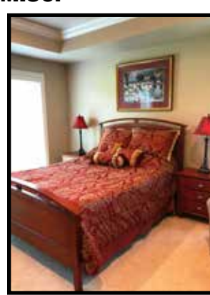
5pc. oak bedroom set: full size bed complete, chest, 2 nightstands & 2-door chest by New Classic Home Furniture, like new