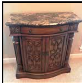
Modern, marble-top 2-door cabinet