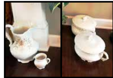
Iron stone: pitcher, chamber, pot, etc.