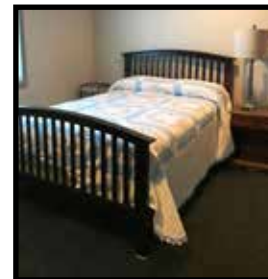
Full size bed, complete