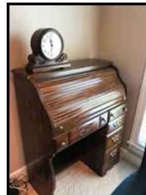
Youth size, roll-top desk