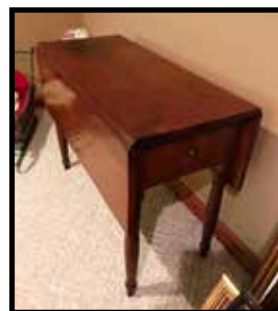
Primitive drop-leaf table w/end drawer, nice