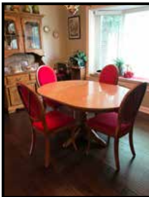
Round oak kitchen table (pedestal-type) & 4 chairs, like new