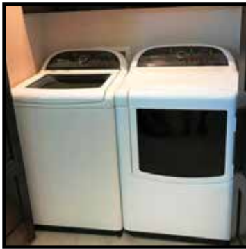
Whirlpool Cabrio Platinum, HE sensor, automatic washer & matching electric dryer, white, same as new