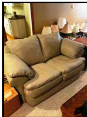
Leather 2-cushion sofa, like new