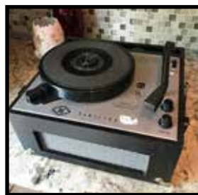
Hamilton record player, table-top type