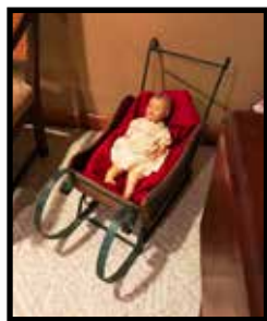
Doll or child's sleigh