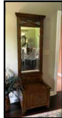
Modern seat-type hall tree, approx. 6' w/ mirror