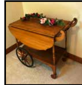
Maple tea cart