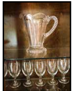
Crystal: bowls, water pitcher, etc.