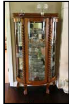
Repo oak, curved glass, single door curio cabinet