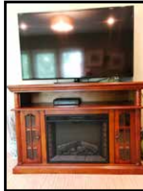
Large electric fireplace (set up for flat-screen TV), nice