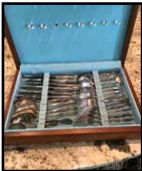
Set Williams Rodgers flatware in case