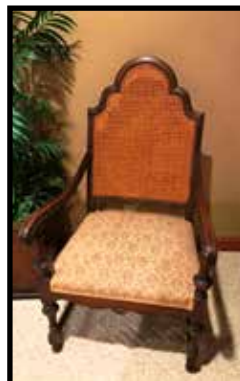
Wicker back chairs