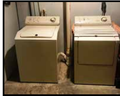
Maytag Oversized Capacity Plus, Quiet Pack, heavy-duty w/lifetime tub, automatic washer & matching dryer, white