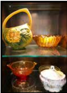
Roseville 7" basket