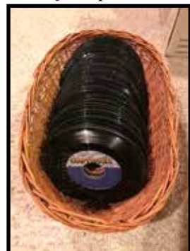
Lot 45 records