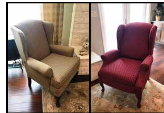
2 wingback living room chairs