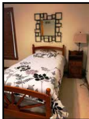
1950's wagon wheel, single bed, complete