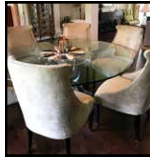
Modern round, glass-top dining room table & 6 high-back upholstered chairs, like new