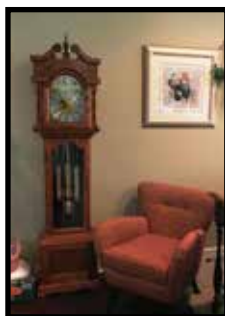
Tempus Fugit cherry wood, grandmother clock, nice