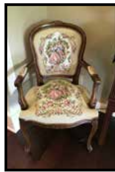
Victorian, armed walnut side chair