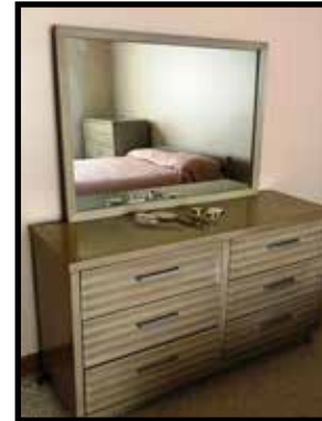
3pc. bedroom set: full size bed complete, dresser & chest by Hungerford, solid mahogany, like new