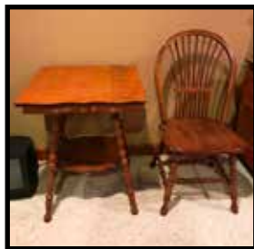
Oak, turn-legged lamp table