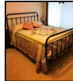
Modern wrought iron, full size bed, complete