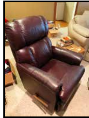
2, brown leather rocker recliners