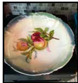
Lot serving bowls: 1 fruit pattern