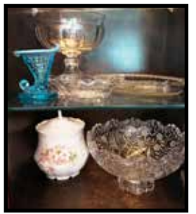
Fenton glass hobnail vase