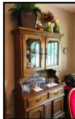
Oak china hutch