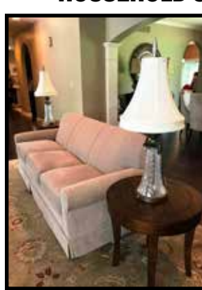
La-Z-Boy 3-cushion sofa, like new