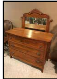
Oak dresser w/mirror