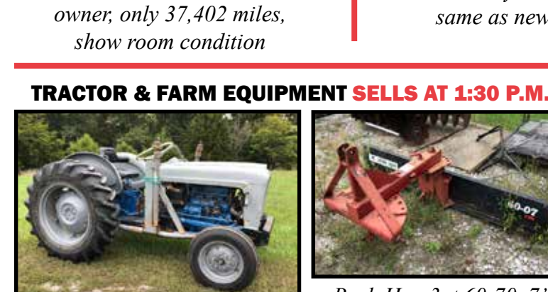
Ford 601 (State Hwy tractor). wide front-end, 3pt hitch, 13.6-28 tires, sells w/trip bucket front-end loader, clean, runs good