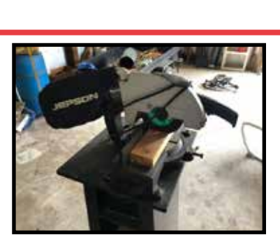
Duracraft 10" miter saw on stand