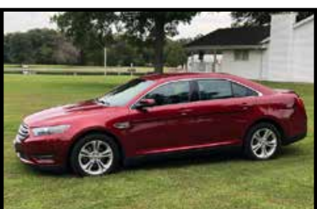
2015 Ford Taurus SEL, flex fuel 3.5L, V6, 6-speed automatic, ruby red metallic TC, charcoal black leather seats, heated front seat, front-wheel drive, 4-door, one owner, only 37,402 miles, show room condition