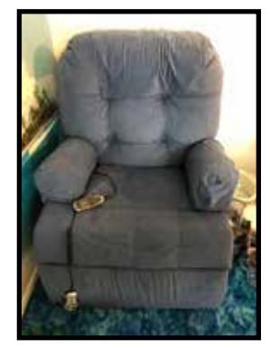
Power lift chair w/vibrator, blue