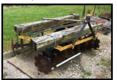
3pt King Kutter 6' disk