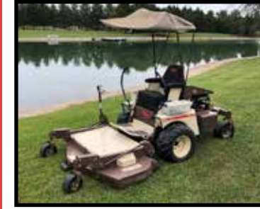
2001 725 G-2 Grasshopper zero-turn, hydrostatic, 24.5hp, 61" cut, one owner, extra clean, gas

- Grasshopper 5' front-mount blade, fits above zero-turn, sells separate