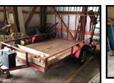
2001 76"x10' single-axle trailer w/drop down ramp, red, nice, like new w/title