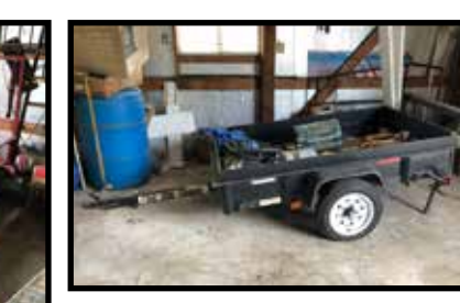
4'x72" single-axle trailer w/ dump bed & sides, no title