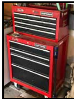
Craftsman 2pc roll-around tool cabinet