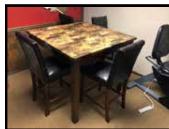
Bar-height table & 4 chairs, nice