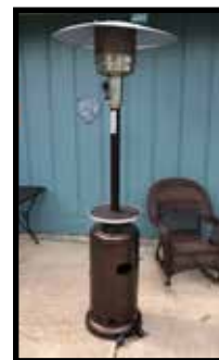
HiLand propane, outdoor patio heater