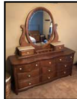
Oak queen size bedroom set w/Serta series w/adjustable base (foot & headboard) w/matching bow front dresser & nightstand (approx. $5,000 new), same as new