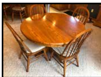
Round oak pedestal-type dining room table & 6 oak bentwood chairs, nice