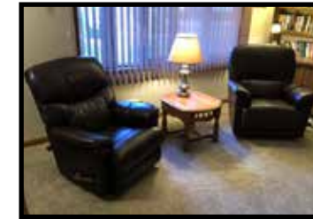
La-Z-Boy brown leather rocker/recliner, like new