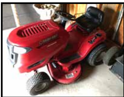
Troy-Bilt Pony 7-speed transmission w/42" cut