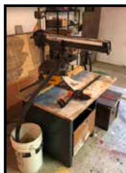
Power Kraft radial arm saw