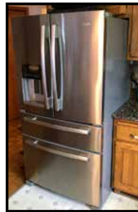
Whirlpool double-door, stainless steel refrigerator w/bottom freezer, water & ice dispenser, looks new