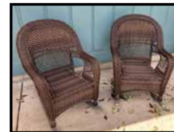
2 patio wicker rockers