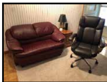
Over-sized office chair, like new