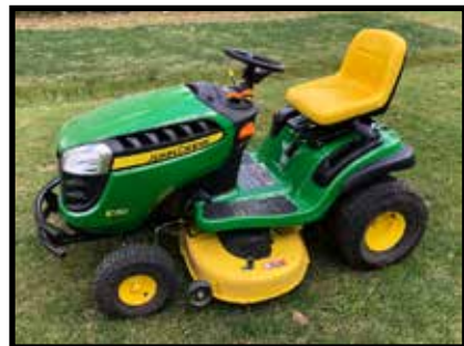
2020 John Deere E130, 100 Series riding lawn mower, hydrostatic, only 4 1/2 hrs., same as new