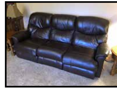
La-Z-Boy brown leather, 3-cushion reclining sofa, like new