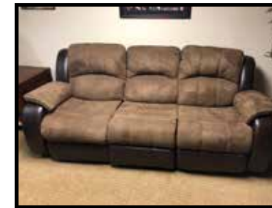
3pc sectional living room set: 3-cushion sofa w/reclining ends, 2-cushion loveseat w/recliners & corner section, brown, nice set