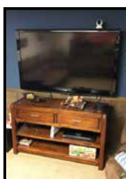
Sharp 60" flat-screen TV