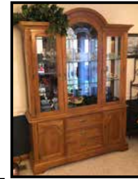
Large oak 3-door china hutch