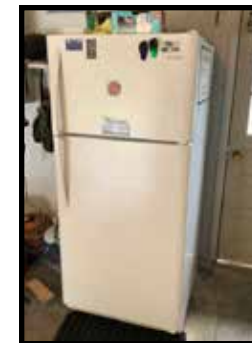
Frigidaire refrigerator, white, nice, less than 2yrs old