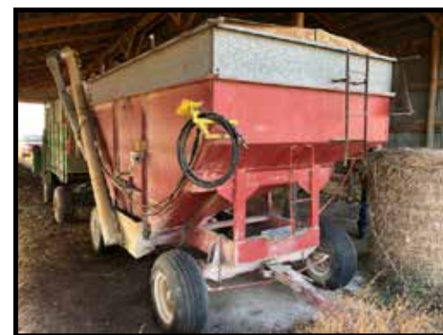
Seed tender, 275-300bu. electric running gear, hydra fold auger, homemade tarp