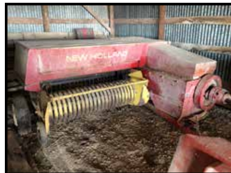
New Holland 315 wire-tie hay baler, 1 owner, SN 440738