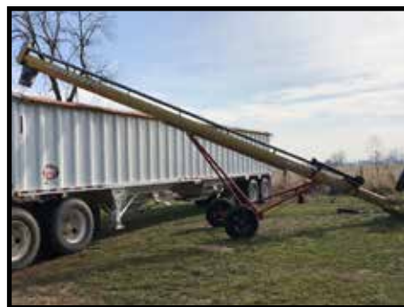
Westfield WR100-31, 31' portable 10" grain auger