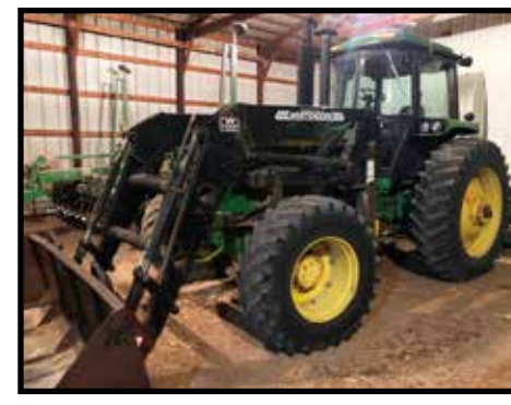
1988 John Deere 4450, SN RW4450H026716, MFWD, QR trans. 140hp w/cab, 3 hydraulics, 18-4-42 tires, 1000 & 540 PTO, super clean