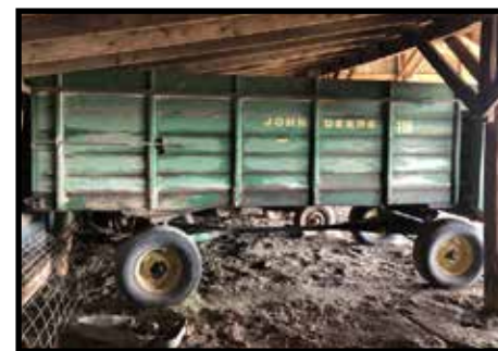
John Deere 115 chuck wagon, 2nd owner, SN 6623