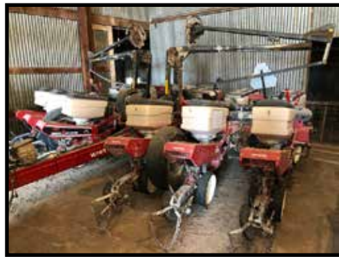
White 6300 12-row, 30" no till planter, 1/2 spike closing wheels, corn & bean plates, plumbed for liquid, bought new, nice planter