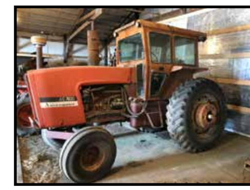
1973 Allis Chalmers 7030 w/ cab, 3pt w/dual hydraulics, 18.4-R38 tires & clamp on duals, approx. 6,5xx hrs.