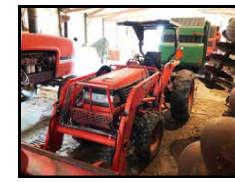
Kubota L 4310 GST diesel tractor, MFWD, power glide 38hp, sells w/Kubota LA 681 loader, open-station w/canopy, shows 4623 hrs.