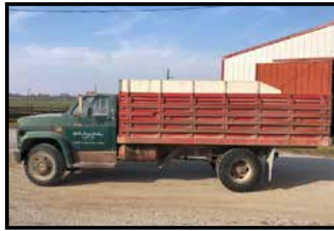
1973 Chevrolet C-60, 2-ton grain truck 350, 4-speed w/2-speed axle, 16' Knapheide combination grain & livestock bed, twin cylinder hoist, only 54,094 miles, 2nd owner (bought on Bill Hawkin's sale), good rubber