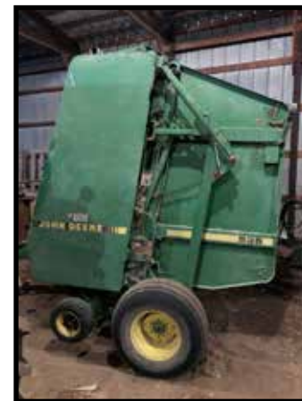
John Deere 535, 5'x6' string-tie big bale baler, 540 PTO, SN X988078, 2nd owner