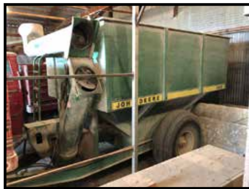
John Deere 400 grain cart, 1000 PTO, bought new