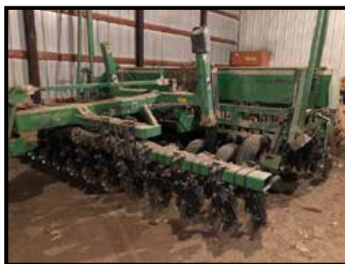
Great Plains solid stand 15, 24-hole drill, 7 1/2" spacing, no till, center pivot hitch, SN GP-47287, nice drill