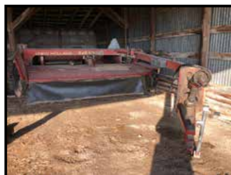
New Holland 1411 discbine, 2nd owner, SN 609165, pull-type, 10'6" cut