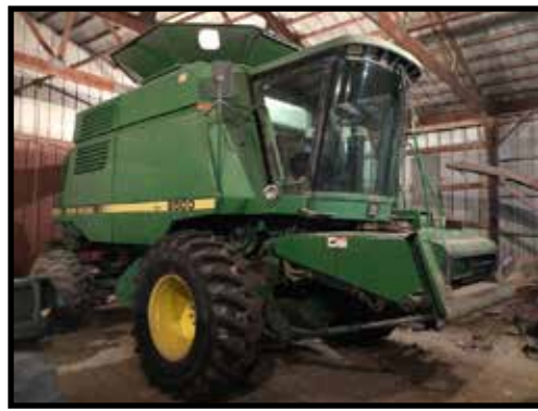
1989 John Deere 9500, 4WD diesel combine, SN 631527, 2nd owner