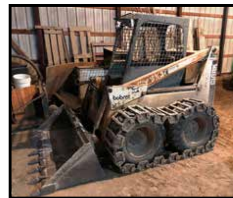
Bobcat 825 hydrostatic tire machine w/tracks, 4-cylinder Perkins, Bobcat controls (hand & foot), 72" smooth & 72" tooth bucket & big bale spear