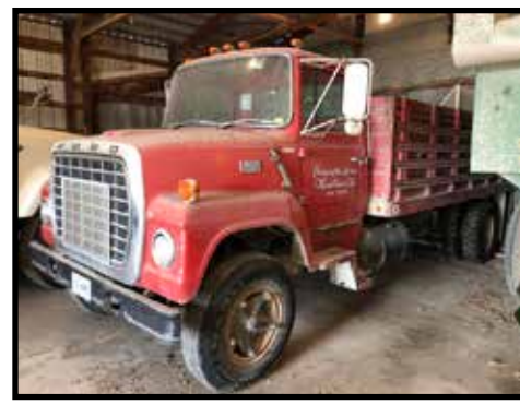
1974 Ford 750, 2-ton grain truck 391, gas, heavy duty 5-speed w/2-speed axle, 16' combination grain bed & hoist, custom cab, bought new