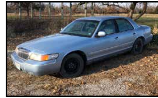
1999 Grand Marquis GS Mercury, 4-door, 124,xxx miles

- 1993 Ford Ranger XLT, 4WD extended cab, automatic, 185,xxx miles