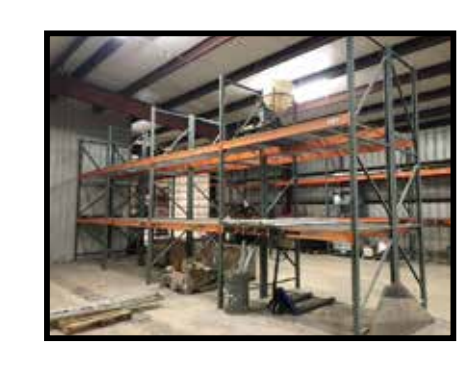
21-8'x16' heavy-duty pallet shelving