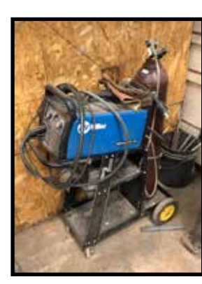
Miller, Millermatic 211 wire feed welder