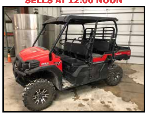
2016 Kawasaki Mule Pro FXT LE, gas 4x4 w/front & back seats, electric power steering, manual dump bed, only 142 miles, like new