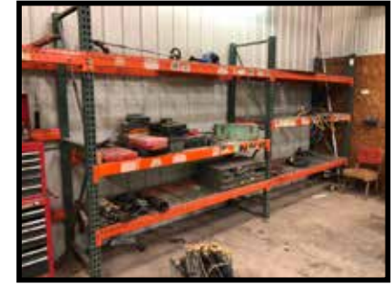
4-8'x8' heavy-duty pallet shelving