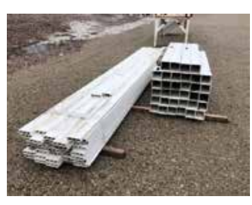
40, 16' pieces