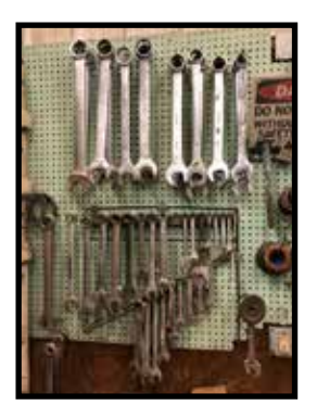
Lot open-end box-end wrench sets, up to 2", some metric