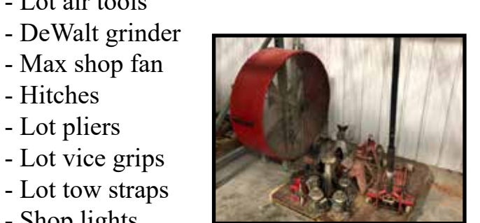
20-ton hydraulic floor jacks