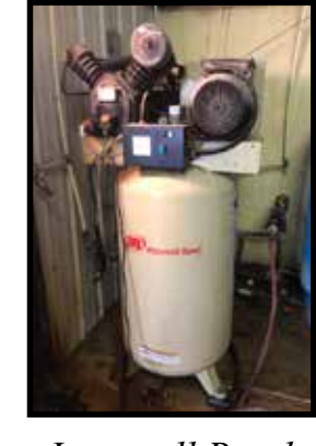
Ingersoll Rand model 2475 upright air compressor