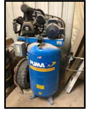
Puma 80-gal heavy-duty shop air compressor, model TUK5080UM