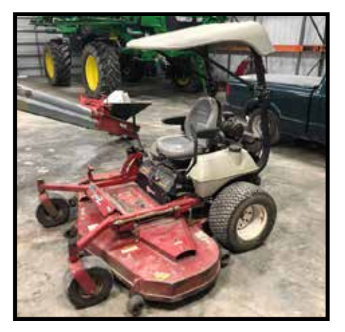
eXmark EPS Lazer Z zero turn lawn mower, 28hp gas, 70" cut