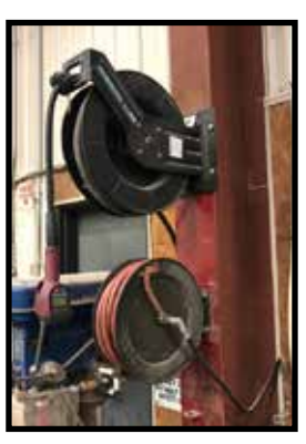
2. auto reel wall mount air hose reels w/60' air hose