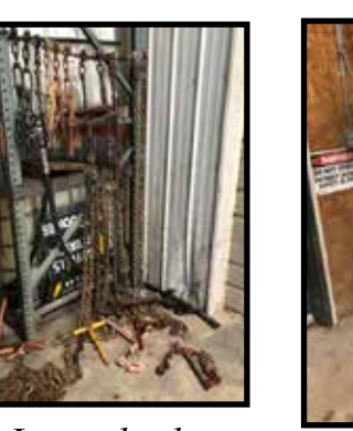
Large lot log chains