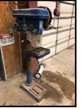
9-speed floormodel drill press