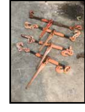
Large lot load binders & load ratchets