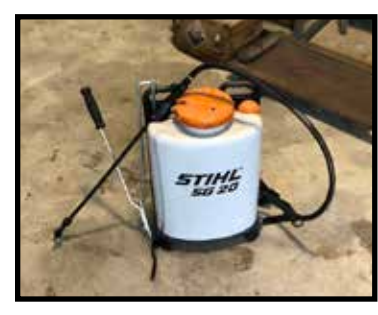
Stihl SG20 backpack sprayer