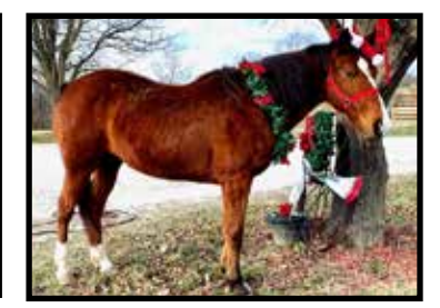
Sugar: 18yr. old 15.2 hands, stout gaited gelding, make a great kid horse, beginner lesson horse or therapy horse, dry lot only with grass hay