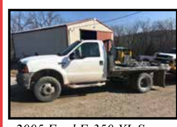
2005 Ford F-350 XL Super Duty, 1-ton dually, 4WD, gas 5.4L, 3V Triton, automatic, 9' flat bed w/gooseneck, like new rubber. 136.xxx miles. nice clean truck