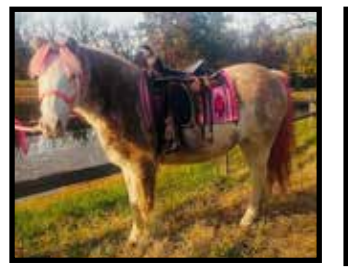
Sandy: 16yr. old, 42" tall Strawberry Roan Paint mare, used on Pony rides at Eagle Fork Pumpkin Patch as part of a pony ride string, did birthday parties (The Famous Unicorn), Amish broke