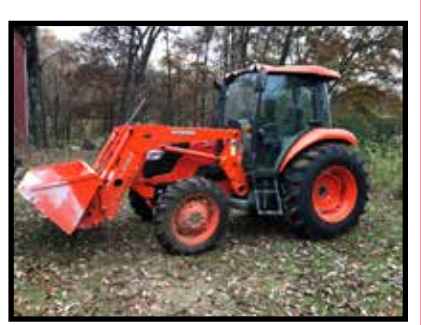
2017 M7060 Kubota diesel tractor, 4WD, hydraulic shuttle, ultra grand cab, 16.9-30 Goodyears, approx. 70hp, sells w/LA 1154 loader, bought new, only 40.5hrs, same as new w/ emissions warranty till 2022

- Westendorf TA-26 hydraulic front-end loader w/74" bucket. fits on the 826