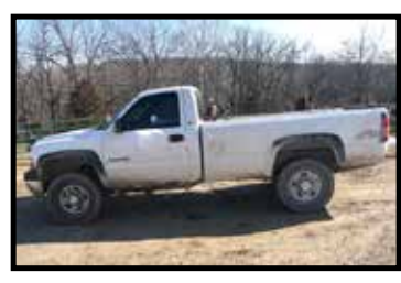
2001 Chevrolet 2500 heavy duty pickup, 4x4, gas, like new rubber, 108,xxx miles