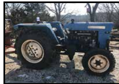
Rhino 554, 4WD, 55hp diesel tractor