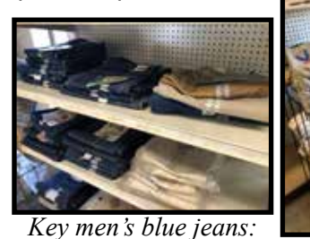
Carolina men's 33x34, 36x36, 44x32, work gloves, large 32x36, 32x30, etc. selection