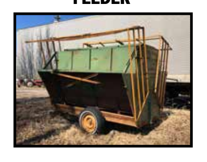
COX 4000LB PORTABLE CATTLE FEEDER ON RUBBER, SINGLE AXLE W/PIN, NICE FEEDER

- 1987 Chevy Silverado 20, <sup>3</sup>/<sub>4</sub> ton, 4WD, automatic, 2nd owner, new gas tank, runs good, 130,xxx miles - 1985 Chevy Silverado 20, \frac{3}{4} ton, 4WD, single cab, mounted Western snow plow, may split - Misc. truck parts