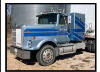
1992 International road tractor, sleep over w/ Cummings N-14 diesel, 9 speed transmission, rebuilt rear end, approx. 40.000 miles. nice truck