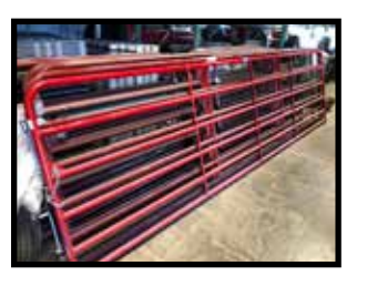
Pipe farm gates: 1 - 16^{\circ} red HD , 1 – 16' HD 2'' , I - 10' utility, 2 - 8' utility, 3 - 12' & 2 - 6' HD. 2 - 6' utility (all red, new, stored inside)