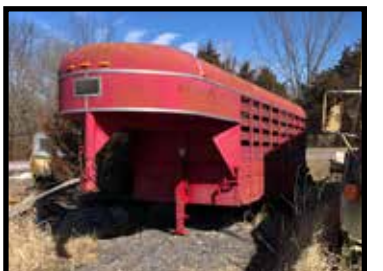
1991 SG-16, 16' Cornelius gooseneck stock trailer, 7000 lb. axles w/center gate & side door w/title

- 1991 20' homemade trailer, frame only w/title