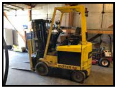
Hyster 45 electric lift truck, Model 3300 lb. cap.