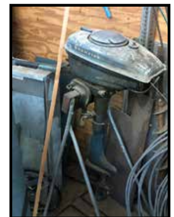
Antique Champion outboard motor, 40's-50's era