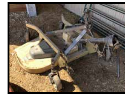
Land Pride FDR 2572, 3pt, 6' finish mower