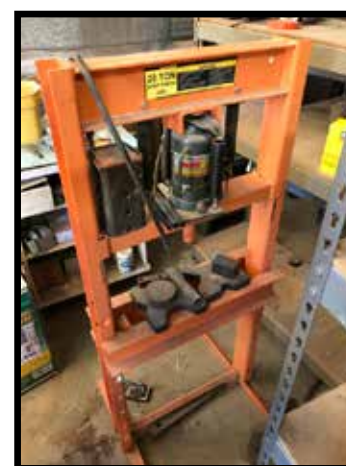
20-ton floor-model press