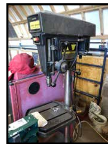
Craftsman floor-model drill press