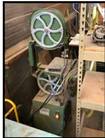
Central Machine floor-model, 4-speed, 14" wood cutting band saw