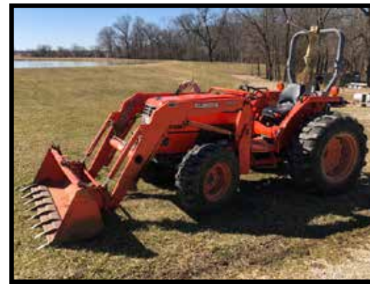
2008 Kubota MX5000 utility special diesel tractor, hydrostatic, 4WD, open-station, sells w/LB 702 hydraulic front-end loader, bought new, only 1,909hrs