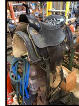
18" SMX Professional Choice air ride saddle