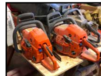
2, Husqvarna 460 Rancher chainsaws