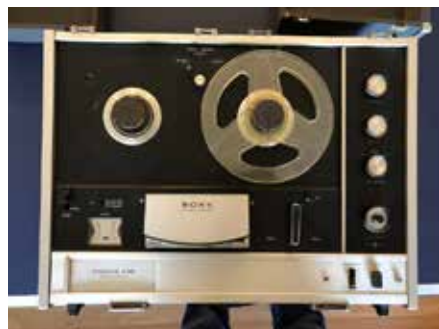
Antique Sony reel to reel