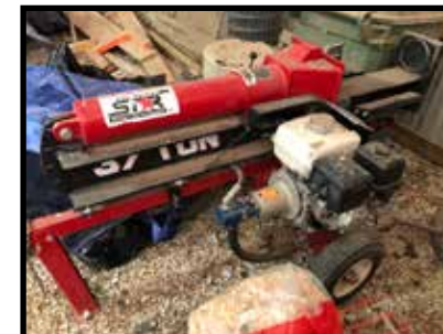
North Star 37-ton wood splitter, trailer-type w/270 Honda gas engine, like new