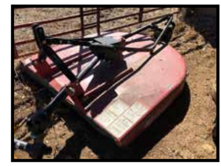
Squealer SQ172, 6', 3pt brush hog