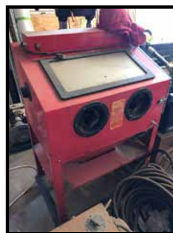
Sand blaster bin-type, floor-model