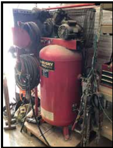
Husky Pro 80gal, 4hp, upright air compressor