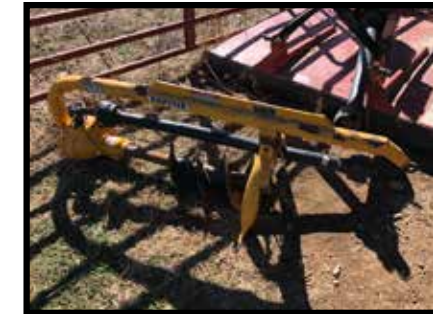
3pt Danuser post hole digger w/6 & 12" auger