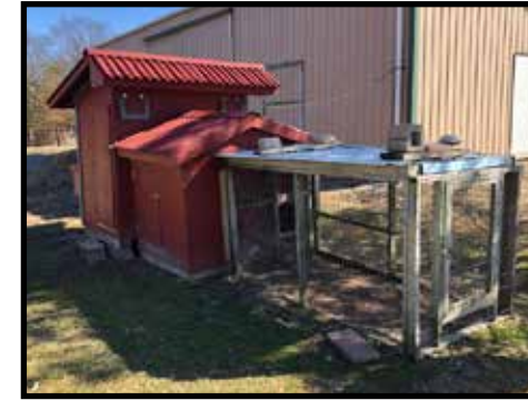
6'x8 1/2' portable red barn chicken house w/6 laying boxes & pen, nice