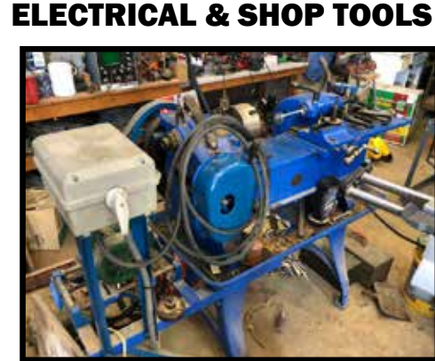
Colcord metal lathe, floor-model