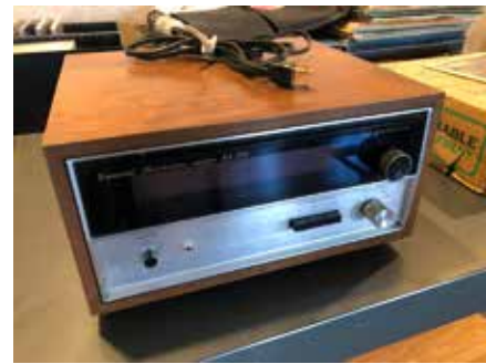
Antique Sansui stereo w/speakers