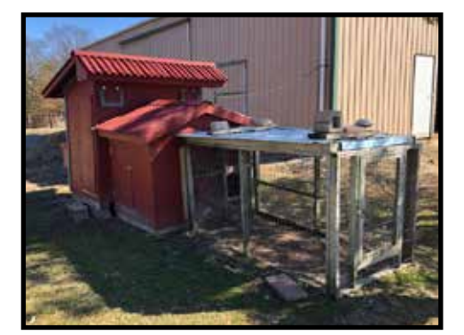
6'x8 ½' portable red barn chicken house w/6 laying boxes & pen, nice