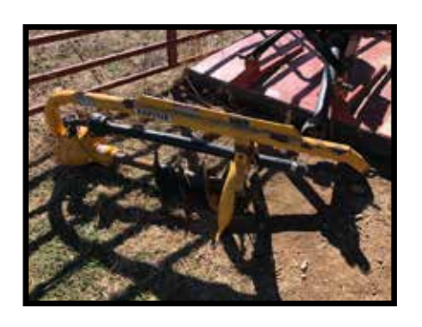
3pt Danuser post hole digger w/6 & 12" auger