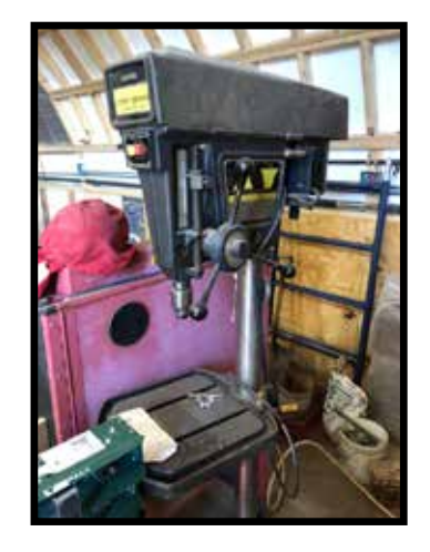
Craftsman floormodel drill press