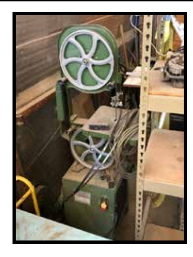
Central Machine floormodel, 4-speed, 14" wood cutting band saw