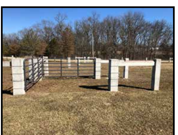
For more pictures or to view the property, go to our virtual tour at: thornhillauction.com

Here's one that offers it all! Beautiful custom home, stocked lake, horse or livestock combination shed & heated shop w/living quarters. Bring your pets and come to the country. Here's one of the finest we've sold anywhere!