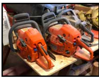
lit- 2, Husqvarna 460 Rancher da chainsaws