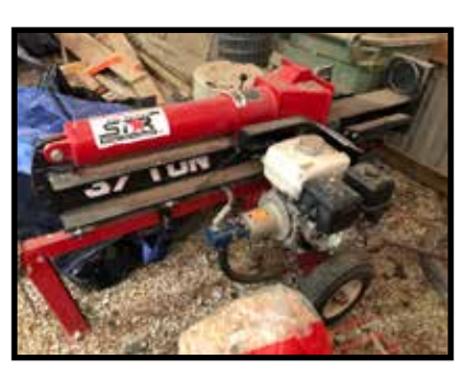
North Star 37-ton wood splitter, trailer-type w/270 Honda gas engine, like new