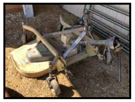
Land Pride FDR 2572, 3pt, 6' finish mower