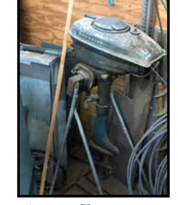
Antique Champion outboard motor, 40's-50's era

- 1986 Lowe 18' big jon bass boat w/custom cover, 40hp Mercury outboard, trolling motor, steering console, front & back seats, marine grade plywood deck w/allweather carpeting, w/trailer & titles (new hoses, gas tank & tune-up by Boat Works in Keysport, IL in 2019)