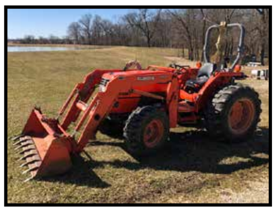
2008 Kubota MX5000 utility special diesel tractor, hydrostatic, 4WD, openstation, sells w/LB 702 hydraulic frontend loader, bought new, only 1,909hrs