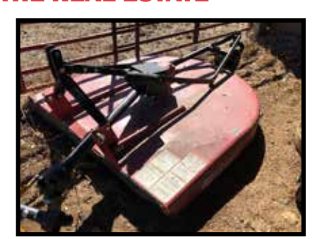
Squealer SQ172, 6', 3pt brush hog