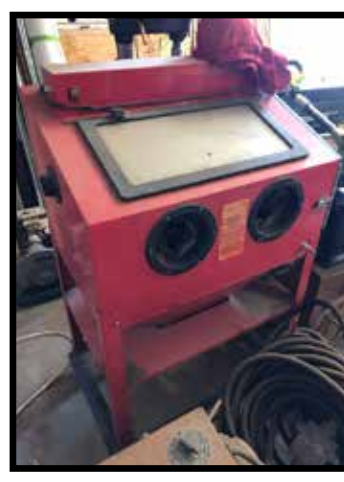
Sand blaster bin-type, floor-model