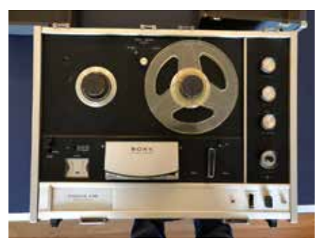
Antique Sansui stereo w/speakers