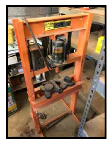
20-ton floor-model press