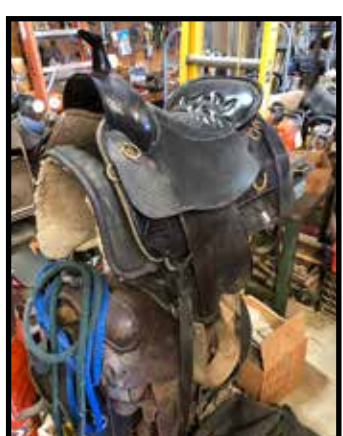
18" SMX Professional Choice air ride saddle