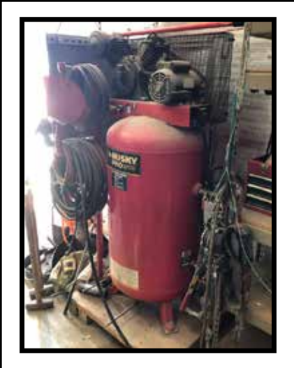
Husky Pro 80gal, 4hp, upright air compressor