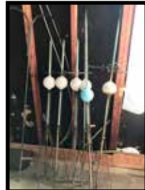
6 lightning rods w/glass balls