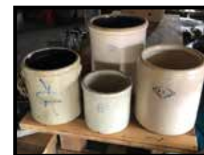
6gal crown pattern crock 6gal Pittsburg pottery crock & 4gal bee sting crock