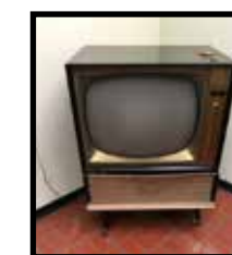
1940's retro black & white Philco TV