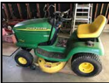
John Deere LT 155 riding lawn mower, 15hp, 38" cut, automatic, bought new, like new