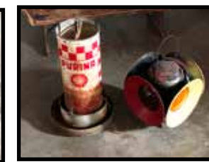
2 RR lanterns