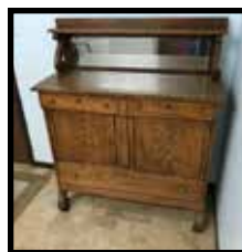
Oak buffet w/mirrored back, nice