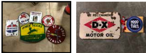
D-X motor oil, double sided