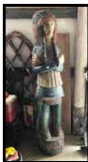
6' wooden cigar store display