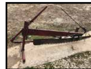
Folding Sawing Machine Co. Chicago, IL, museum pc.