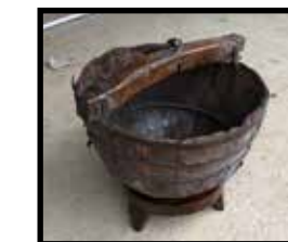
Primitive well bucket