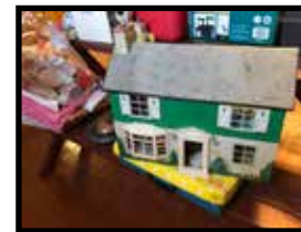
Tin 1950's child's dollhouse