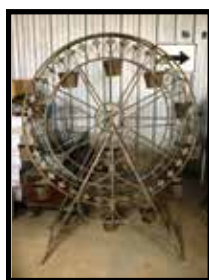
6' tall flower pot, Ferris wheel moves, neat pc.