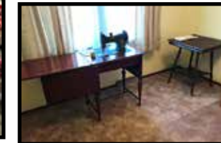
Oak turned-leg lamp table