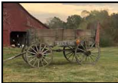
High-wheel wagon w/scoop board, great condition

- Buck board wagon w/John Deere running gear w/iron wheels, great condition