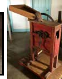
Pony corn sheller