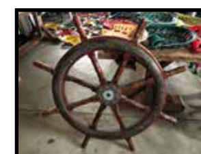
Wooden ship wheel