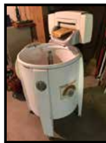
Speed Queen wringer washer, good, works