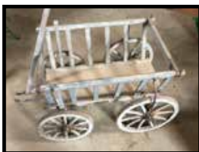
Wooden goat wagon