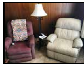
Leather rocker recliner

- Leather rocker recliner - Kitchen table & 6 chairs - Single bed, complete - Lifestyler 700 exercise bike - Rival microwave - Fellowes paper shredder - Coffee table/end table set - 2, living room armed chairs