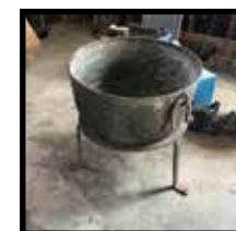
Lard kettle & stand