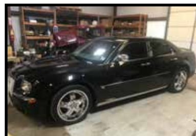
2006 Chrysler 300, 5.7L, V8 Hemi 4door, special edition, 37,XXX miles, nice