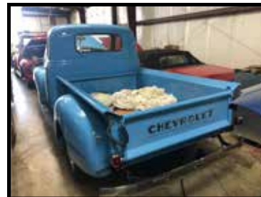
1950 Chevrolet 3100 stock, restored original