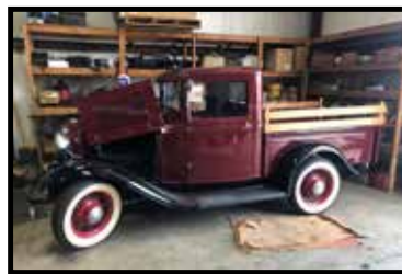
1932 Ford Model B, complete restoration