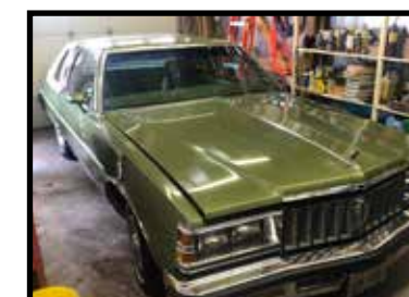
1979 Pontiac Bonneville Landau, 2-door, low miles, nice