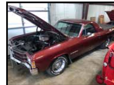
1971 Chevrolet El Camino, 350 auto, nice