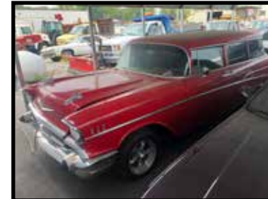
1957 Chevrolet station wagon, 2 door, red, Crate 350, runs & drives