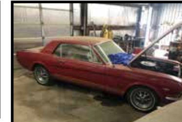
1966 Ford Mustang 289 GT, nice, needs interior