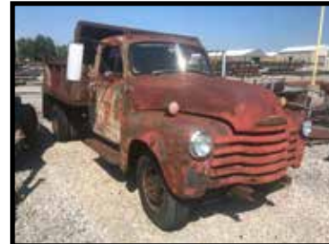
1951 Chevy 1 ton dump truck, runs, to restore