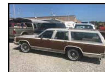
1988 Ford station wagon