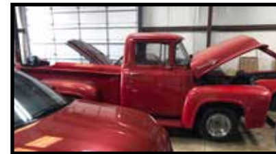
1956 Ford pickup F-100, street rod 351, restored