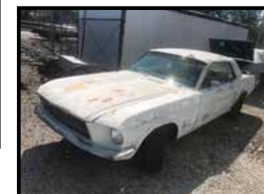
1968 Ford Mustang 289 auto, runs & drives