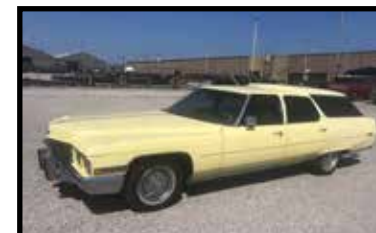
1972 Fleetwood Brougham Cadillac 4 door wagon, rare, nice