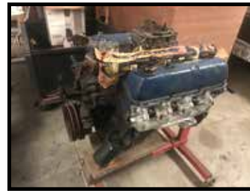
429 Ford rebuilt