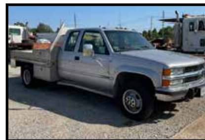
1994 Chevy 1 ton dually 4 wheel drive, diesel, aluminum flatbed w/toolbox, restored, nice