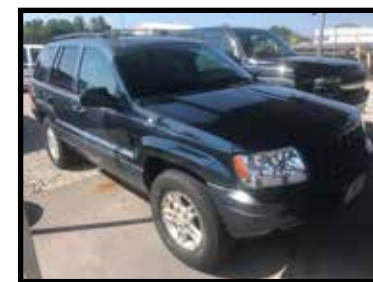
2000 Jeep Grand Cherokee Limited 4x4, approx. 25,000 miles on new V8