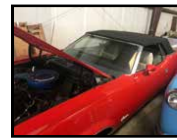
1973 Mercury Cougar convertible 351 Winsor, restored