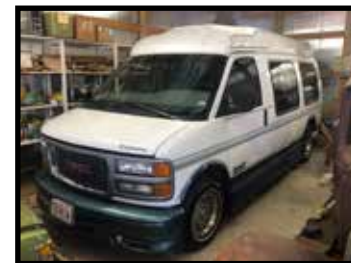
1997 GMC van, Limited SE Explorer, nice