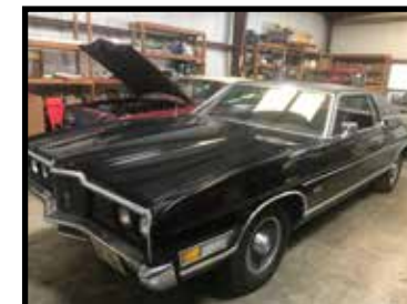
1972 Ford LTD 2 door hard top, 429, nice, restored