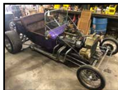
1923 Ford T Bucket 350, nice