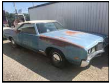
1972 Ford LTD convertible, to restore