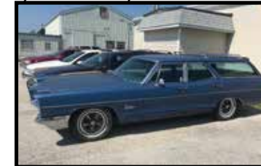
1966 Blue Pontiac Bonneville station wagon