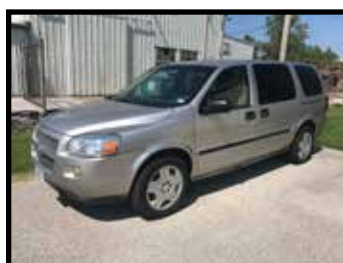
2007 GM Uplander LS, Limited SE Explorer, nice