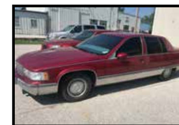
1995 Fleetwood Brougham Cadillac, nice