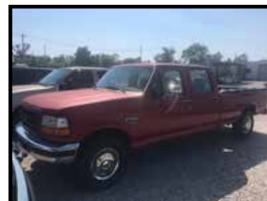
1996 Ford F350 XL 4 door 1 ton Power Stroke diesel, 2 wheel drive, automatic, runs & drives