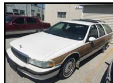
1993 Buick Roadmaster Estate, runs & drives