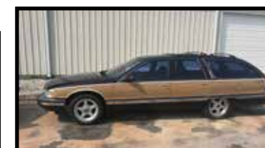
1996 Buick Roadmaster Estate station wagon, runs & drives