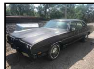
1972 Ford 4-door (429)