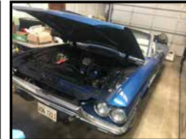
1964 Ford Thunderbird convertible 390 w/Parade boot 390, original