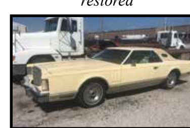
1978 Lincoln Continental Marc IV, 2 door, 460, runs