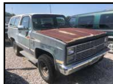
1984 Chevrolet Blazer K-5, square body, runs & drives