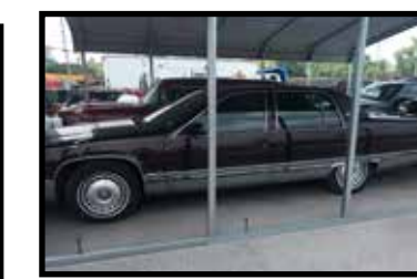
1994 Cadillac, nice