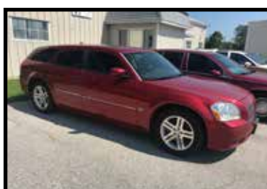
2005 Dodge Hemi Magnum RT, 4 door, nice, 120,XXX miles