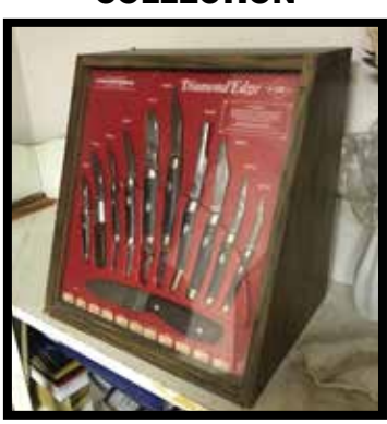
Diamond Edge 11 knife N.O.S. store display