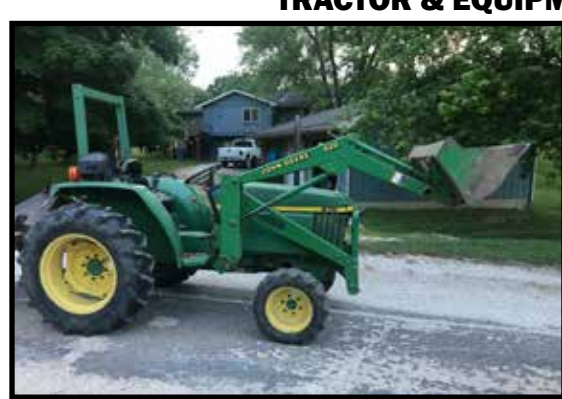
John Deere 870 diesel tractor wide front end, 3 pt. hitch, open station with roll bar, front wheel drive, power steering with PTO sells with 420 John Deere front end loader, 12.4-24 tires, shows 806 hours, extra clean