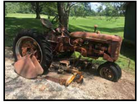
IH Farmall A Model FC tractor. tri front end SN 18234 sells with Wood L306 belly mower, been sitting, AS IS