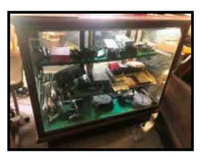
Keen Kutter store display cabinet 40" tall x50"long x23"deep, nice