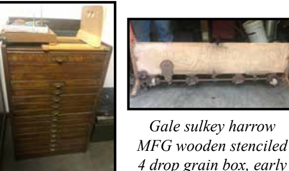
15 drawer wooden file cabinet (New London courthouse)