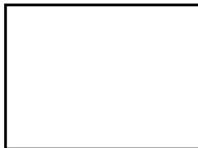
Lot Texaco models