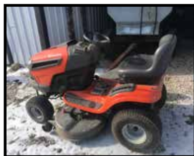
Husqvarna YTA 22V46 rid- ing lawn mower with 46" mower deck