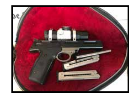
S/W Model 22 A-1, 22 LR semiauto w/Leupold scope w/3 clips

- Wischo - K.G. Eriangen, German 25 cal, 6.36mm sm, SN 25014