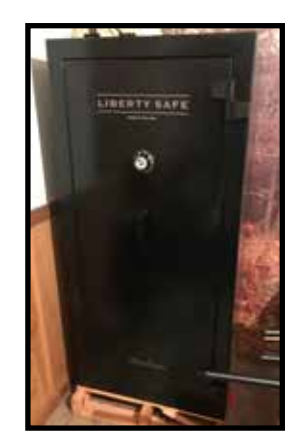
Liberty floor model gun safe