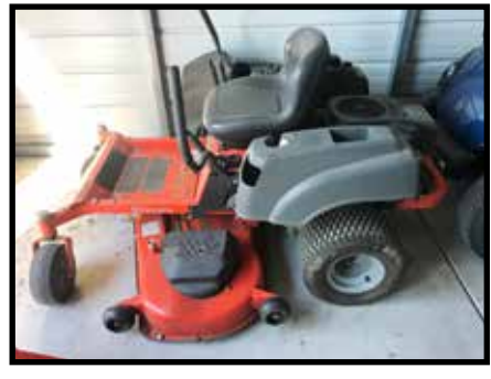
Husqvarna RZ 5424 zero turn lawn mower w/24 hp Kohler engine, nice