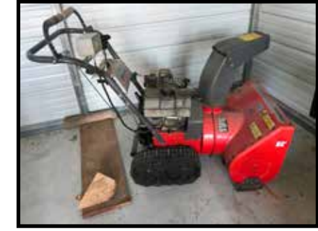
NOMA Canadian #824, 8hp, 24" track type, walk behind snowblower, nice