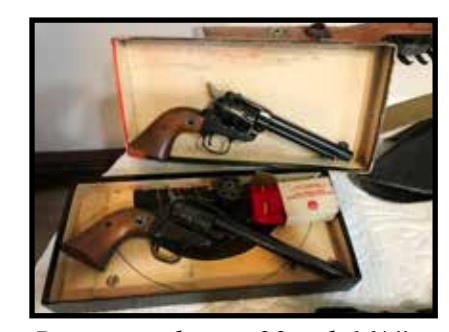
Ruger single six, 22 cal 6 ½" barrel w/extra cylinder, 3 screw

- Ruger single six, 22 cal 5" barrel, 3 screw