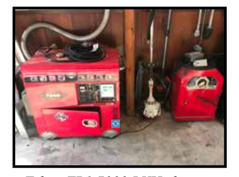
Tahoe TP1 7000 LXH electric start, diesel generator, like new