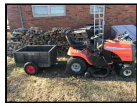
Husqvarna LTH 2042 riding lawn mower