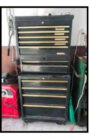
2 pc toolbox