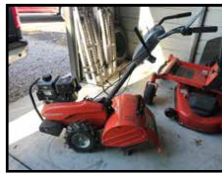
Husqvarna DRT 900 rear tine, 17" rotating tine tiller w/950 B&S engine