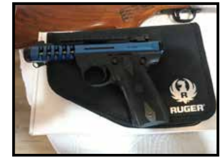
Ruger 22 Mark 3, 22-45 Lite w/case & box

ALL FFL LAWS APPLY. ALL OUT OF STATE FIREARM BUYERS MUST PRESENT A CURRENT FFL LICENSE. NO EXCEPTIONS