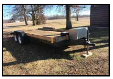
1993, 7'x18' w/2' dovetail (20') tandem axle flatbed trailer w/ramps & ball hitch, nice trailer with title