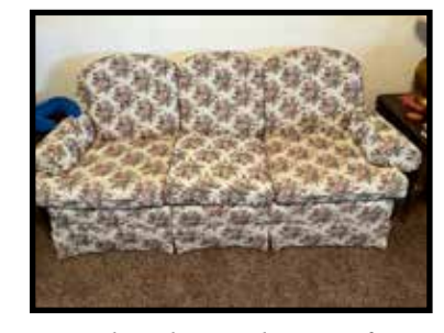
Floral 3 cushion sofa (Justice)