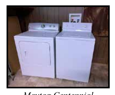
Maytag Centennial commercial technology electric dryer, white, like new & Maytag matching automatic washer, like new