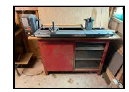
Craftsman 12" wood lathe. spindle feed with base cabinet