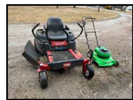
Toro Time Cutter SS-5060 smart speed gas with 50" deck, bought new SELLS at 1:00 P.M.