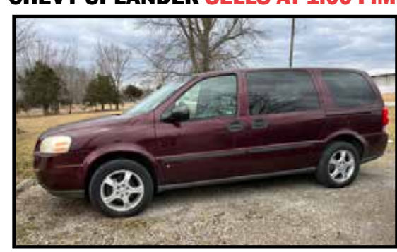
2007 Chevy Uplander LS, bought new only 55,491 miles, nice