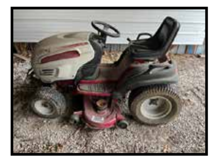
White GT 2150 hydro riding lawn mower (good)