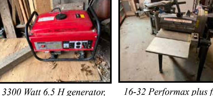
16-32 Performax plus floor model sander