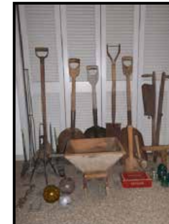
Wood handle shovels