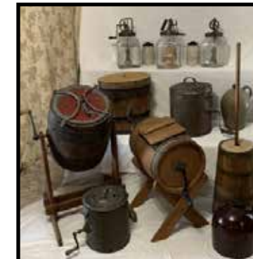
Dazey 80 & 60 butter churn w/screen & paddle