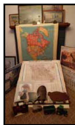
Toy tractors; IH & John Deere