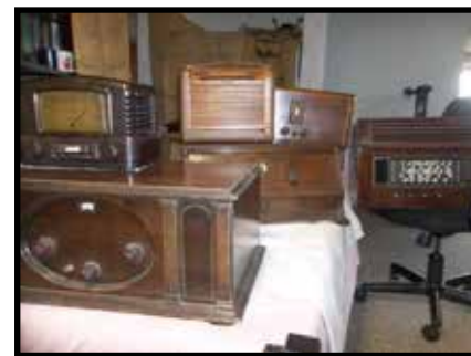
9 antique short wave radio collection: 1920s, 1930s, 1940s, American, Armstrong, Freed, Eismann, Philco, Stewart, Warner, Ward, Neutrodyne