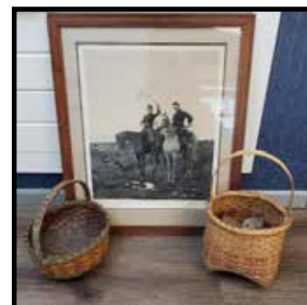
Lot framed pictures