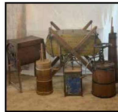
Stave w/wooden band