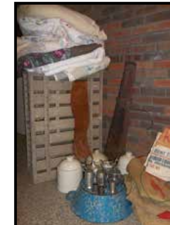
Wooden chicken coop & feeders