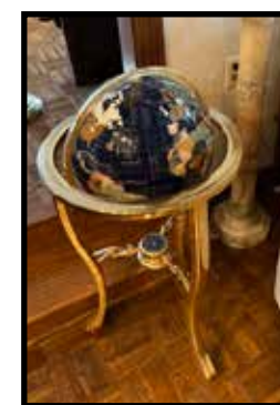
Floor model world globe