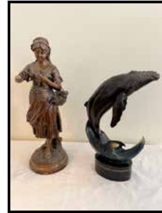
19" Humpback whale, Regat 68/75