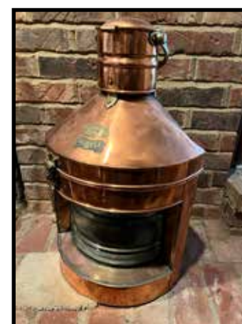
2 copper ship lanterns, Ellerman's Wilson #489 & 490