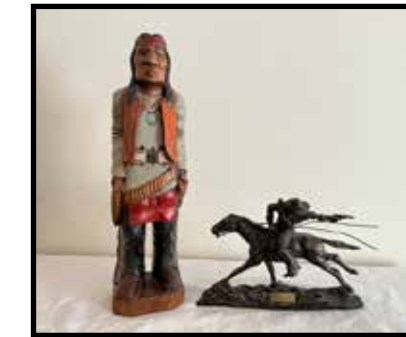
The Pursuit by Alexa Laver