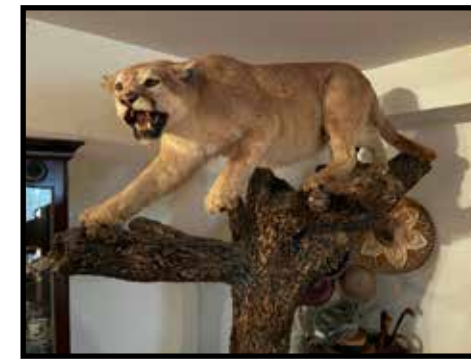
Full body mount lion, mounted in a tree, super piece