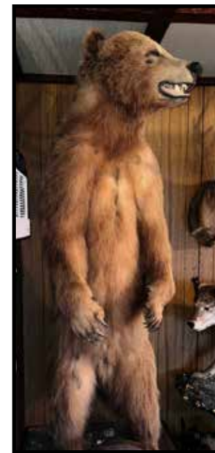
Full body Kodiak brown bear