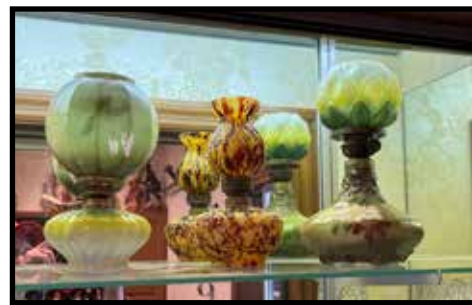
Art glass lamp