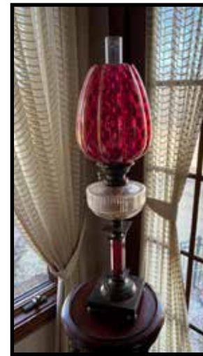
Stemmed oil lamp w/cranberry shade