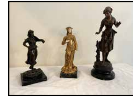
16" Bruchon lady figural