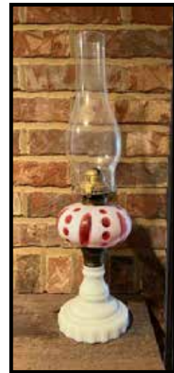
Cranberry, pull down, vintage oil light fixture