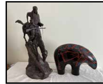
27" Remington, The Indian Trapper