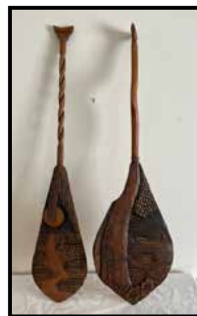
Carved totem type pole