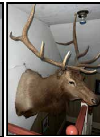
2 Elk shoulder mounts