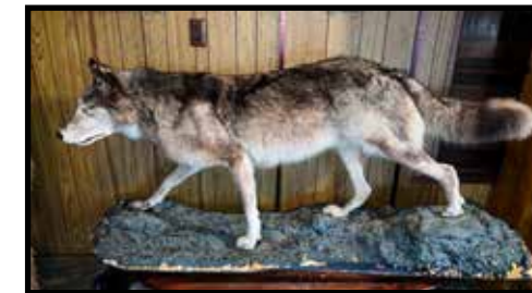
Full body wolf