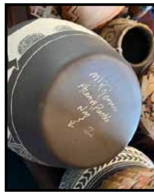
M&R Romero Aroma Pueblo