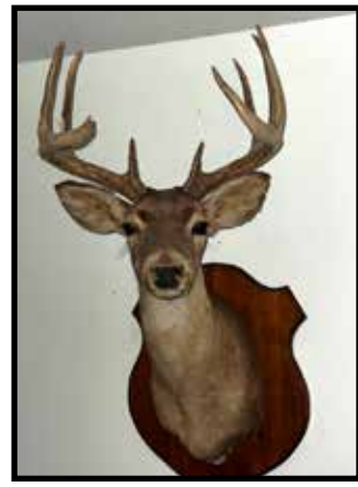
2 Whitetail mounts