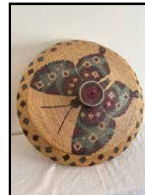
Large oval basket w/lid, butterfly pattern