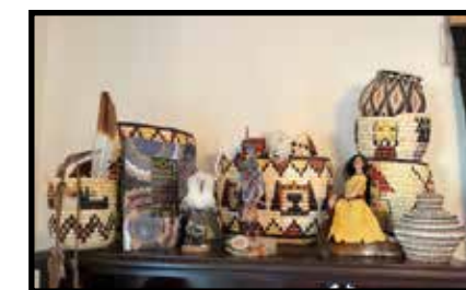
Washoe American Indian Mono coiled utility basket, triangle pattern, 14"