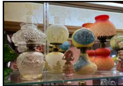
Satin glass oil lamp