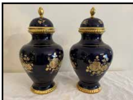
2 Echt-Cobalt, Bareuther Germany, 16"