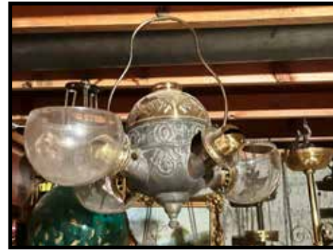
4-angle light fixture