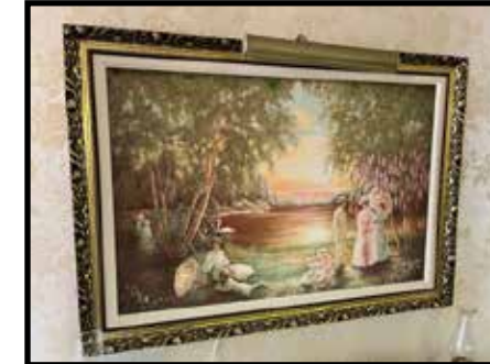
Paintings in frame