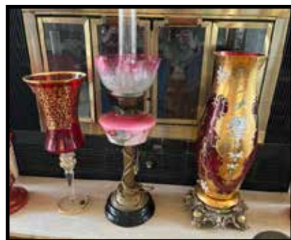
Lot gold overlay, one 20" vase