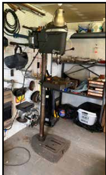
Craftsman floor model drill press