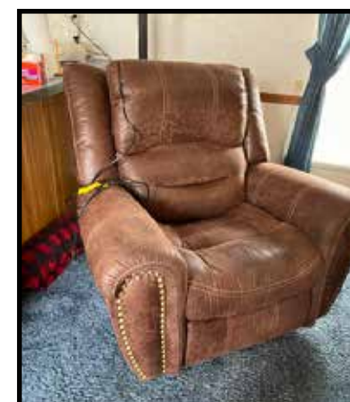
2019 Flex steel power recliner #1710 – 50 PA, brown suede, nice