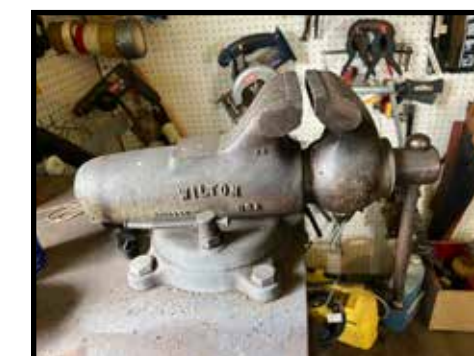
Wilton bench vise