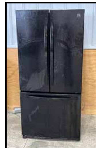
Black Kenmore 2 door refrigerator freezer, like new