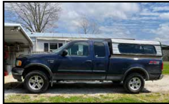
2003 Ford F150 XLT Triton 5.46 – V8 extended cab 4 door off road 4 wheel drive automatic with power and air, heavy miles 247, XXX, clean, good rubber with camper shell, VIN 1FTRX18L63NA98188