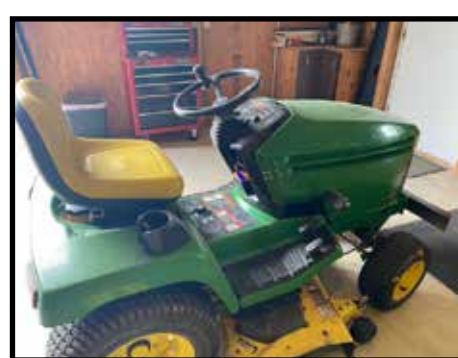
2000 John Deere 345 garden tractor with power steering, hydrostatic with 48" mower deck & 48" snowplow, one owner, 20 hp liquid cooled only 869 hours, super clean