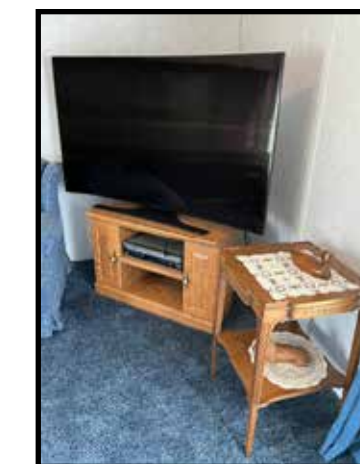
Samsung 64" flat screen TV