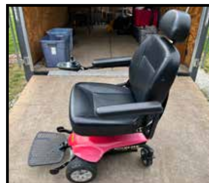
2016 Jazz Pride Select Elite power handicap scooter with charger, runs good