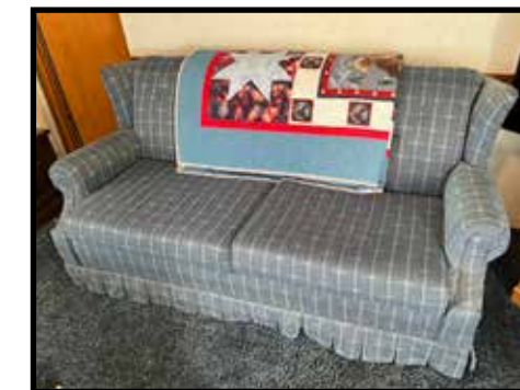
Overnight sleeper sofa in blue