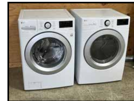
LG he True balance front load auto washer, white, like new & LG he matching sensor dryer LP front load, like new