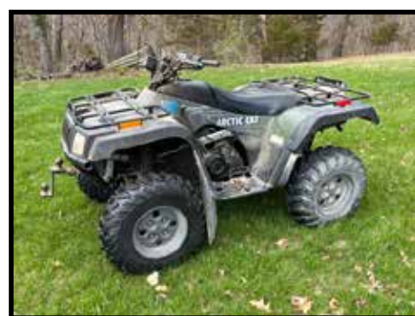
2003 Arctic Cat 400, 4x4 automatic, runs good, shows 1389 miles