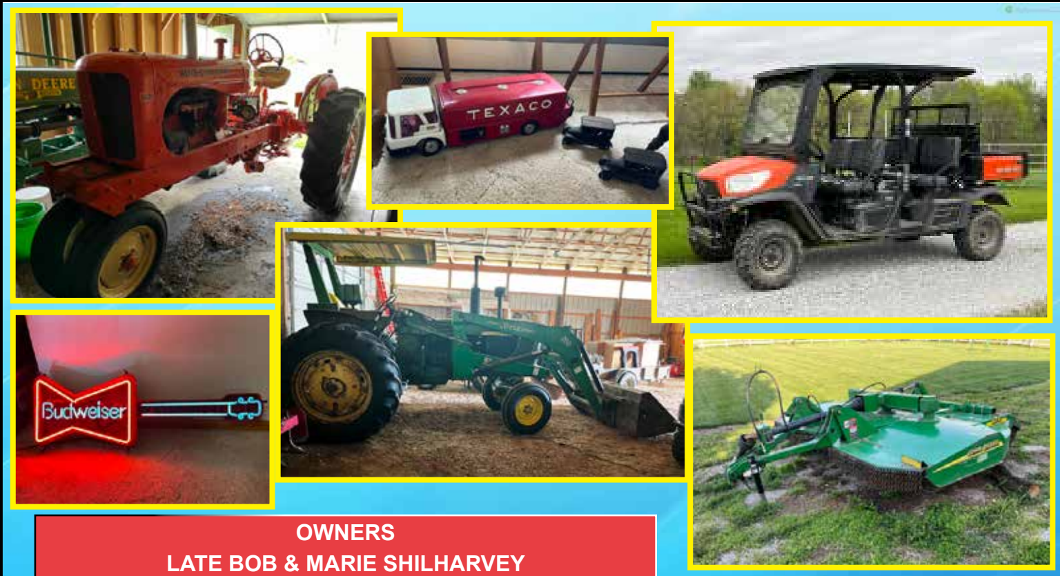
OWNERS LATE BOB & MARIE SHILHARVEY

Note: Sale will be held indoors in case of bad weather.