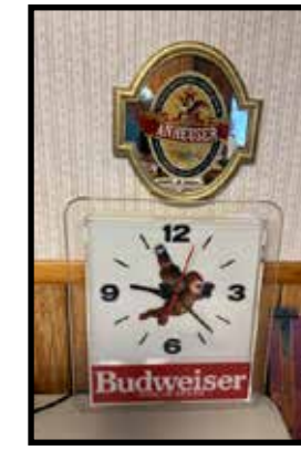
Bud man clock