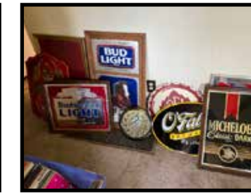
Michelob Classic dark mirror