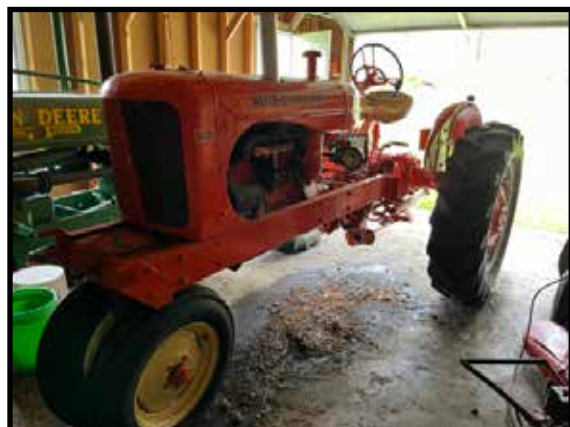
Late 1940s Allis Chalmers WD tractor with tri front end, restored complete tear down, parade ready