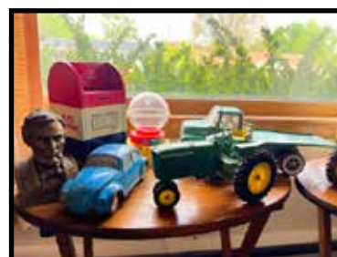
John Deere tractor