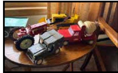
Tonka: jeep, concrete truck, dozer