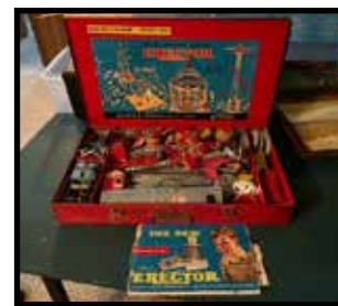
Erector set, complete w/box