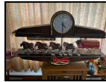
Budweiser hanging Clydesdale spectacular