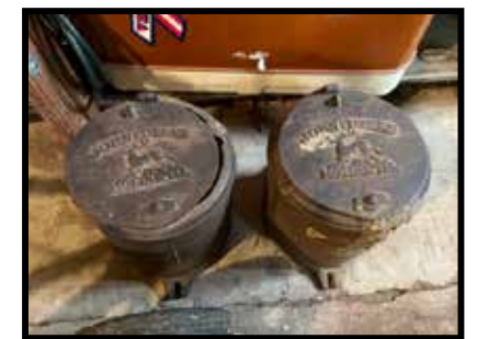
2 early John Deere corn planter boxes