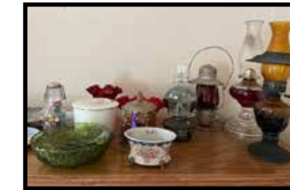
RR lantern, red globe