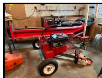
20 ton wood splitter 5hp trailer type, nice