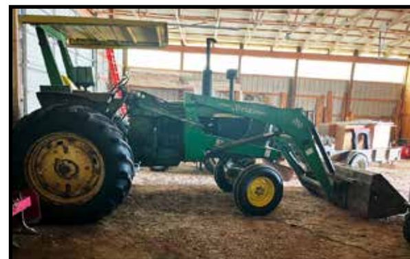
John Deere 4010 diesel tractor with wide front end, 3 pt. hitch, single hydraulics, canopy, 16.9-34 tires sell with Koyker 510 hydraulic front end loader with 7' bucket, shows 7770 hours