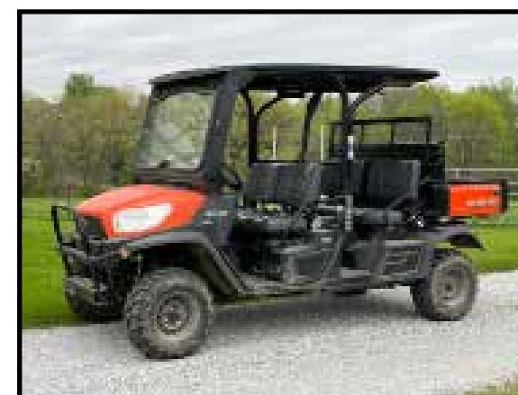
2017 Kubota RTV, X1140W, power steering, VHT-X variable hydro transmission, 4x4, windshield, extra duty independent rear suspension, 2nd row seating w/extra large cargo bed, shows 410 miles, like new, adult driven, one owner