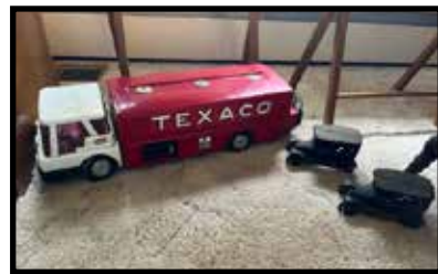
Texaco toy truck