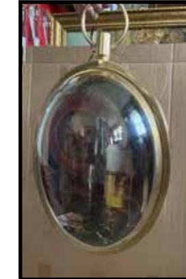
60s Bud rotating clock