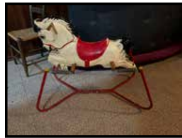
1960s Hi-Prancer child's spring horse