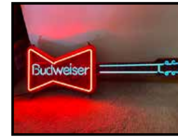
Bud guitar neon