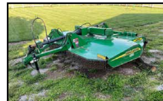
John Deere MX10, 10' pull type brush hog, solid tires with chains, bought new in '05, like new