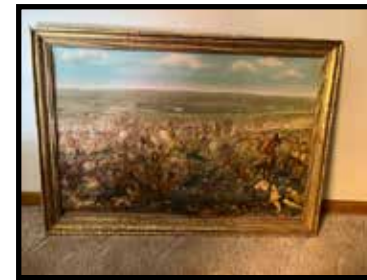
Custer's Last Stand