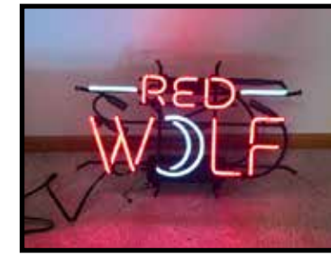
Red Wolf neon